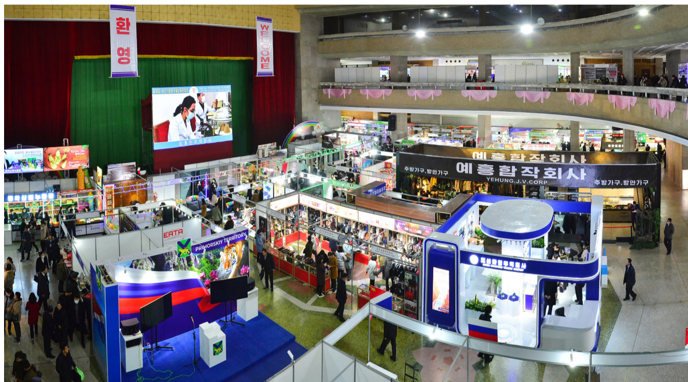
The 16th Pyongyang Autumn International Trade Fair takes place at the Central Youth Hall between November 19 and 25.