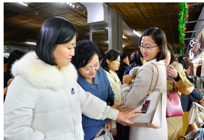
The 2024 autumn commodity exhibition of the Pyongyang Underground Store is held from November 15 to 21.