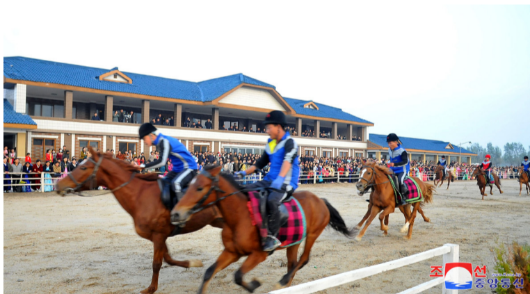
People ride horses at the riding club (above) and cycle down the cycling course in a forest(left).