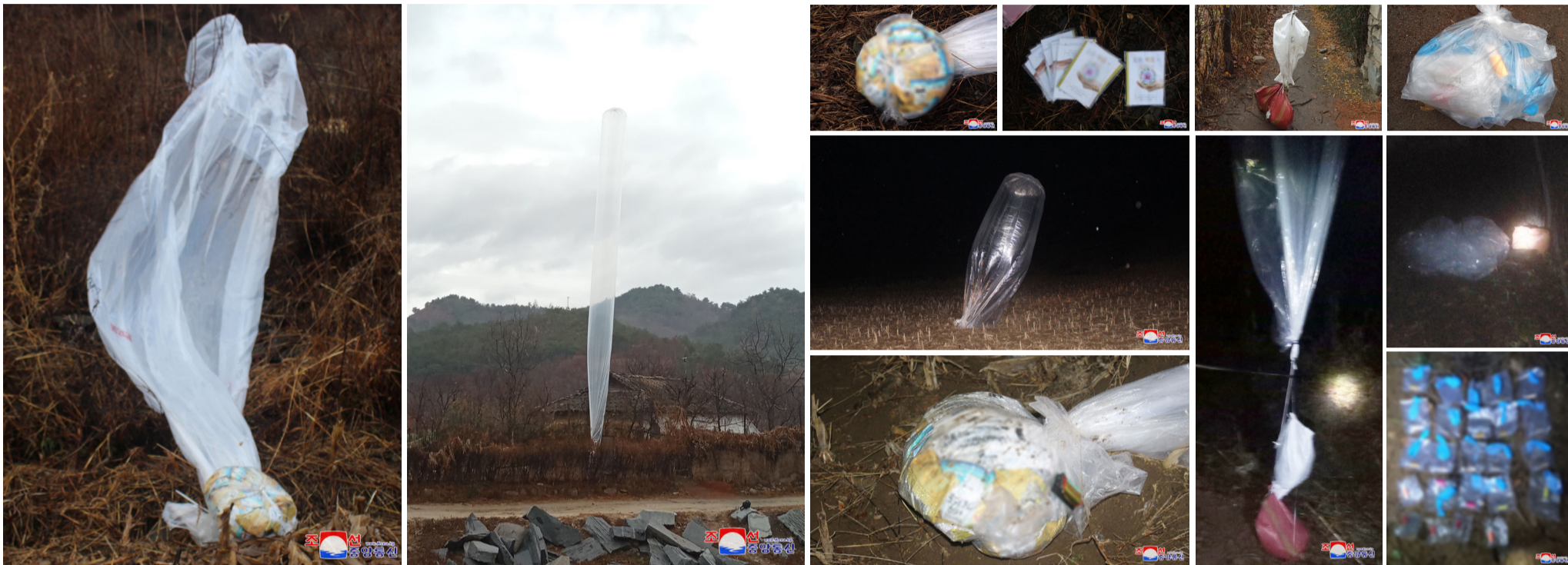
Various kinds of political agitation leaflets and dirty things dropped again by the ROK scum in different areas near the southern border of the DPRK on November 26.

provocation of polluting the inviolable territory of the DPRK by scattering anti-DPRK political and conspiratorial agitation things again.