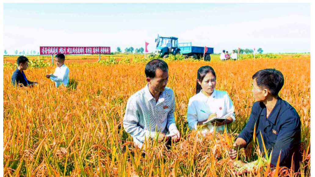
Researchers of the Onchon branch of the Rice Institute under the Academy of Agricultural Science are engaged in research into a new seed for producing high and safe yields.

The reporter could not see a satisfactory scene of golden ears of grain swaying on the field as it was just after the end of harvesting, but the sight of the branch's researchers steadily continuing research with unusual attachment to their job enabled her to picture the bright prospect of farming on reclaimed tideland.