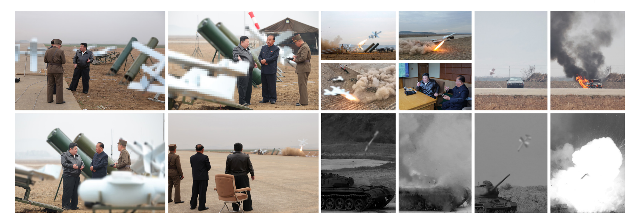
FROM PAGE 2