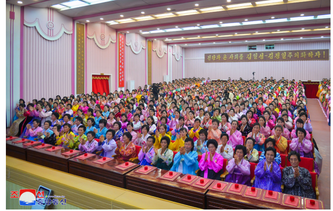
A ceremony for conferring the Communist Mother Honour Prize takes place at the Hall of Women in Pyongyang on November 14.