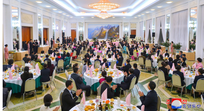
Along streets, Pyongyang citizens, students and children warmly congratulate the players on their triumphant return home and the DPRK Cabinet hosts a reception to welcome the players on November 14.