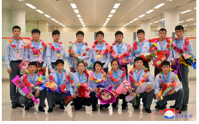
DPRK martial artists return from the 9th International Martial Arts Games on November 14.