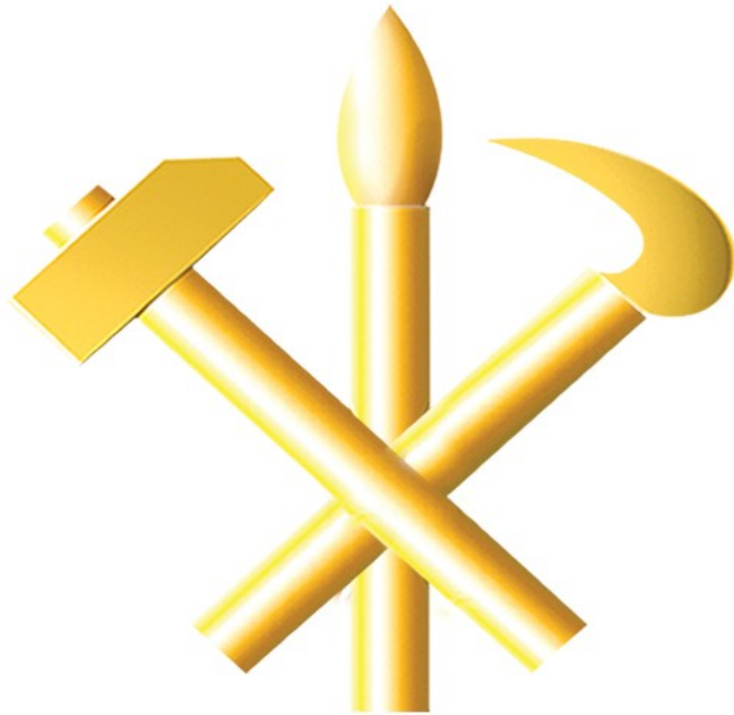
Emblem of the Workers' Party of Korea