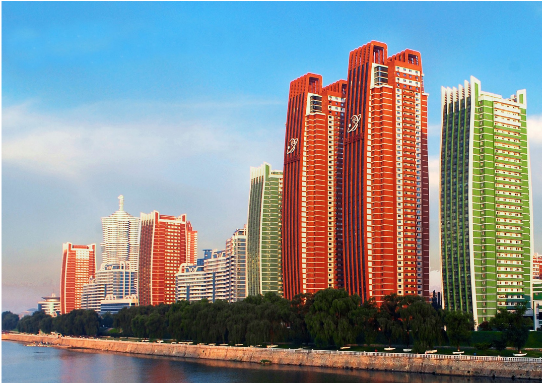
Houses on Mirae Scientists Street on the bank of the Taedong River in Pyongyang and other modern houses are provided to scientists and technicians on a preferential basis.