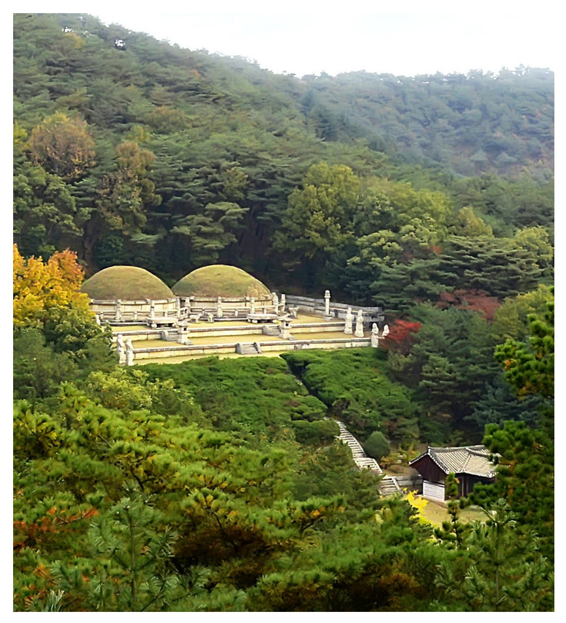
Mausoleum of King Kyonghyo gives a glimpse of the tomb architectural art of Korea in the Middle Ages.