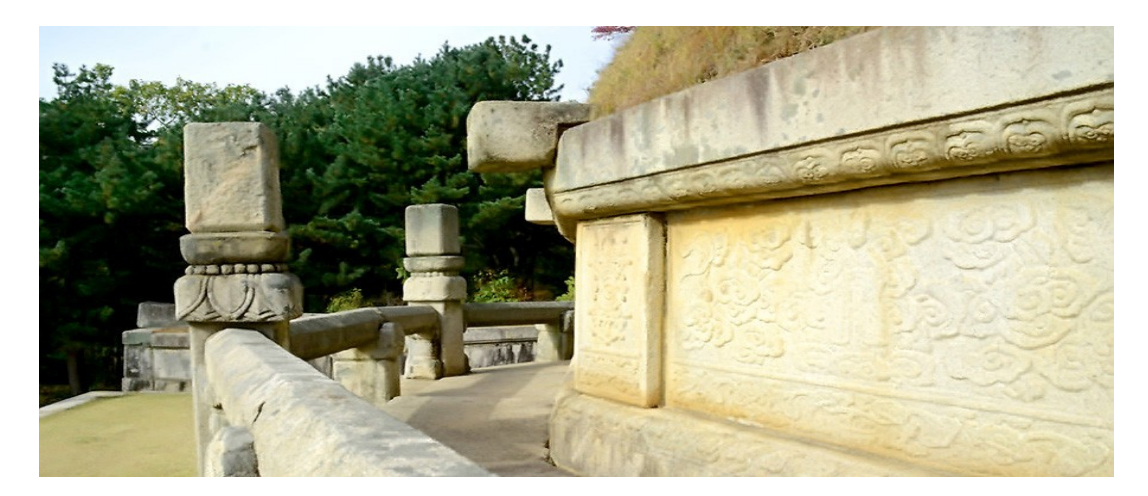
Folding screens and stone rails are neatly dovetailed.