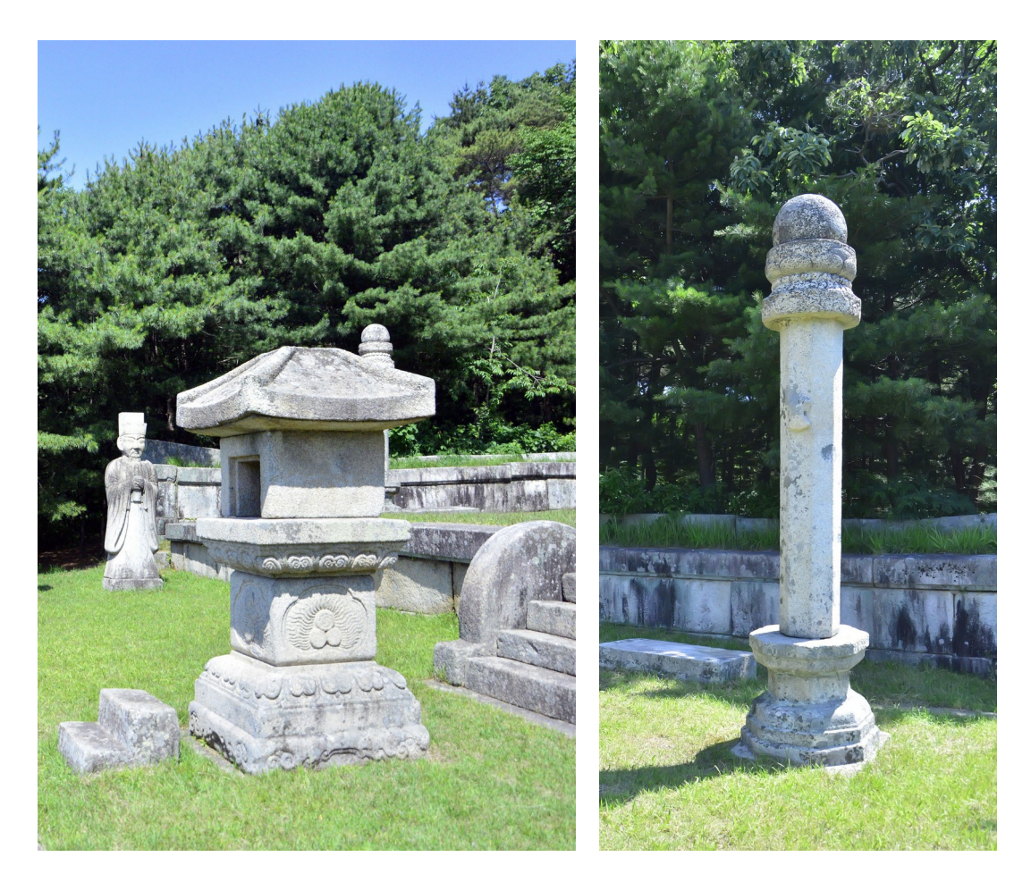
Delicately-processed stone lantern and stone post