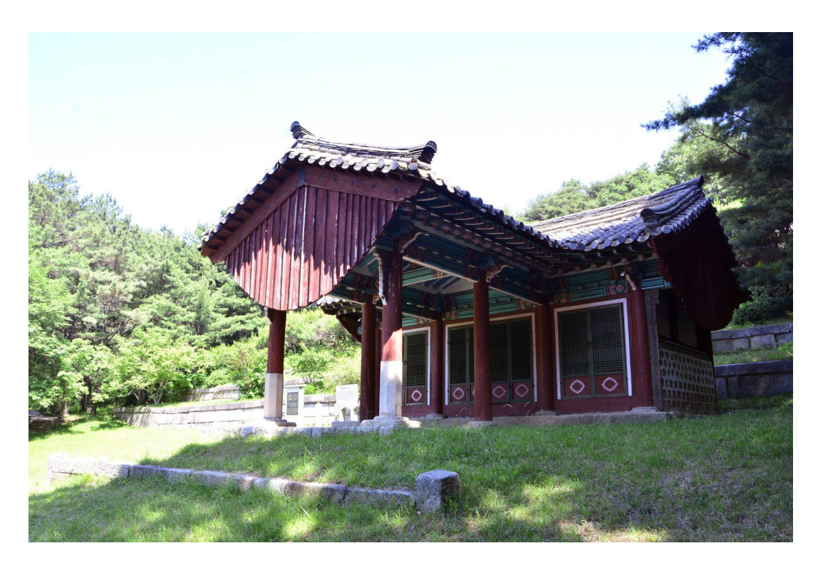
Building for memorial service and its colourfully-painted interior