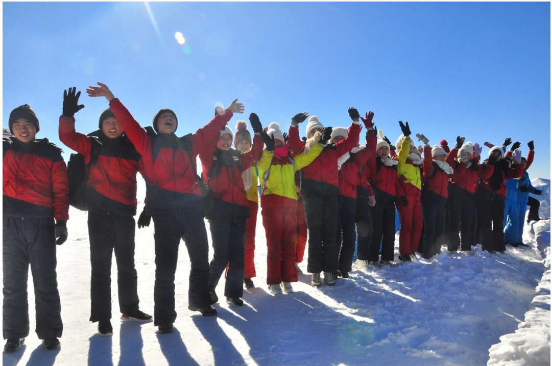
Giving cheers on the summit of Taehwa Peak