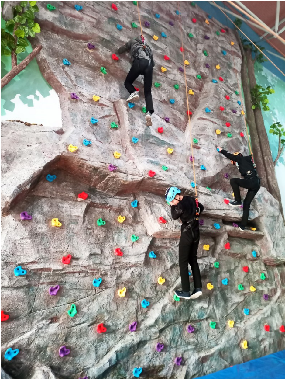
Practicing cliff hanging in the gym