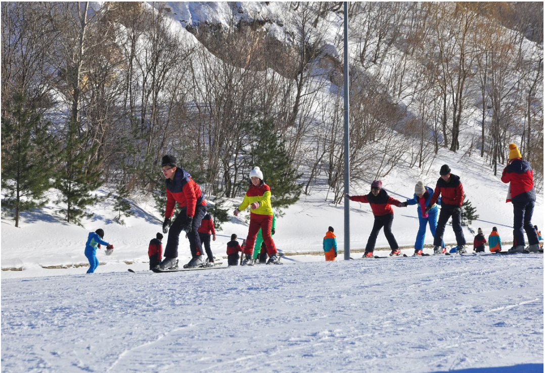
Skiing is fun.