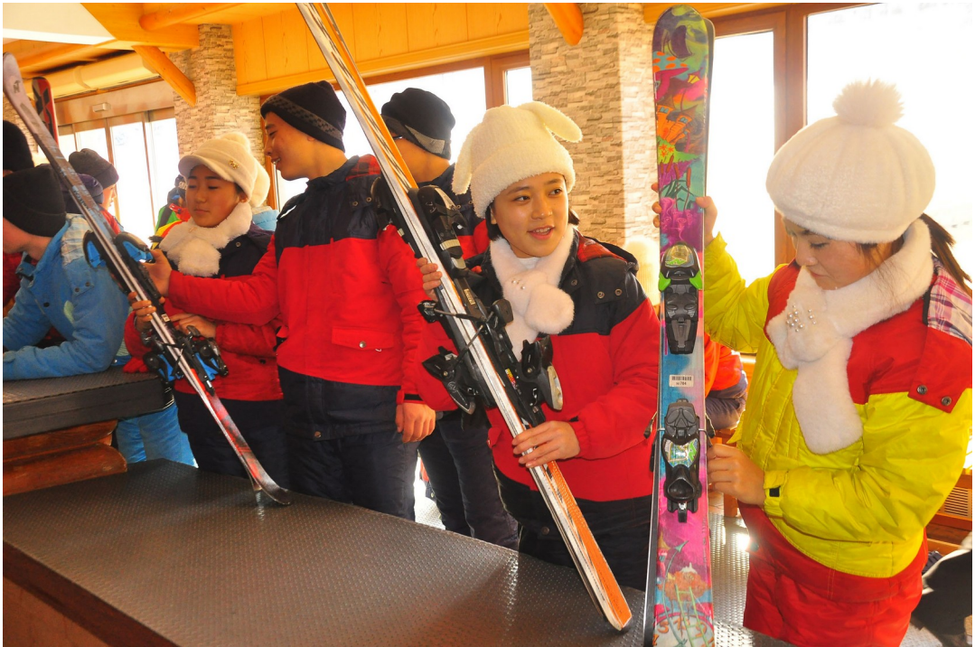
At the ski rental at the Masikryong Ski Resort