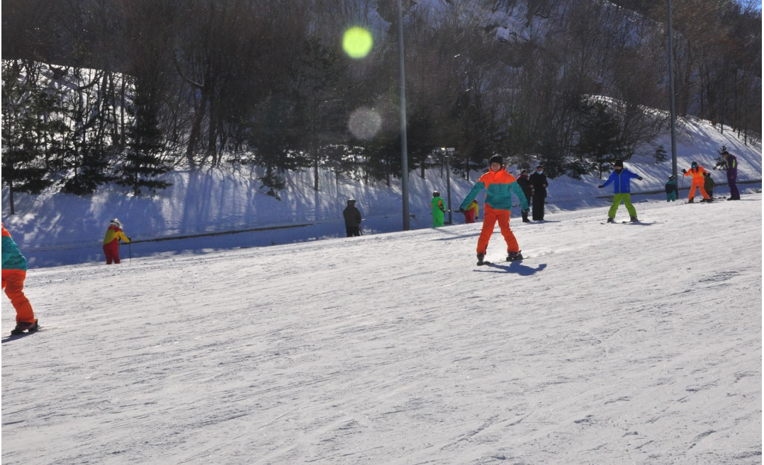
Skiing is fun.