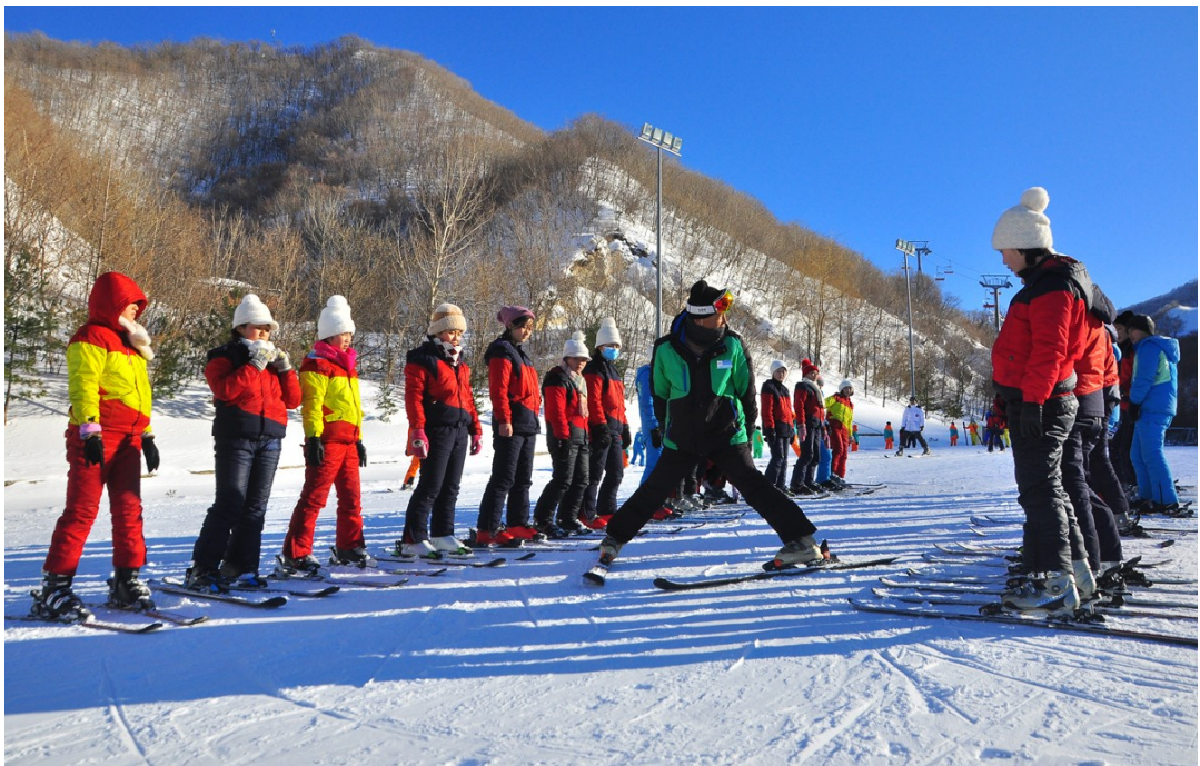
Learning how to ski