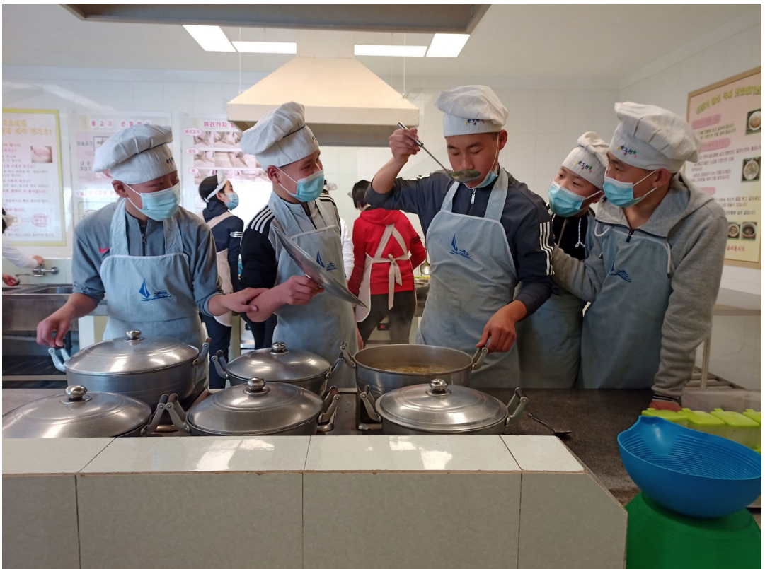
In the cooking practice area at the camp