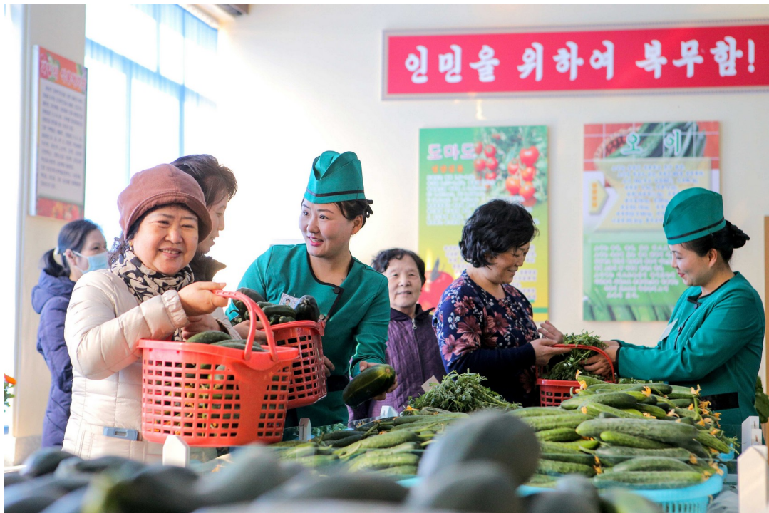
Pyongyang citizens are supplied with fresh vegetables from Kangdong Combined Greenhouse Farm.