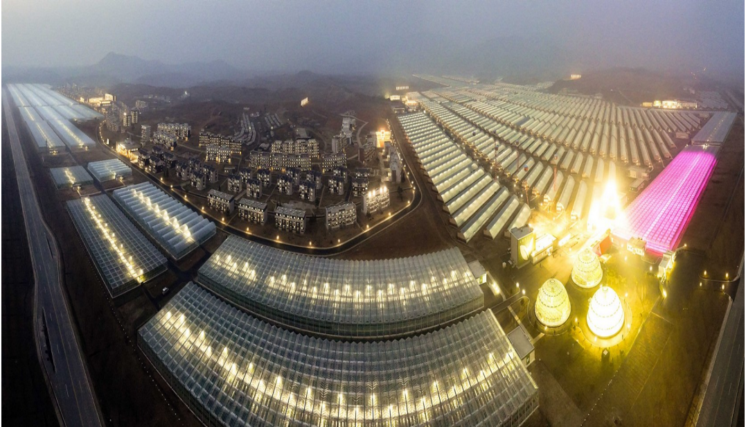
Kangdong Combined Greenhouse Farm, a DPRK's leading vegetable production base in a suburb of the capital city of Pyongyang