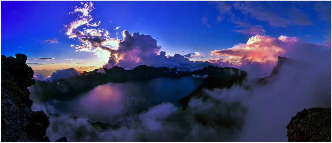
Ever-changing weather on Mt Paektu