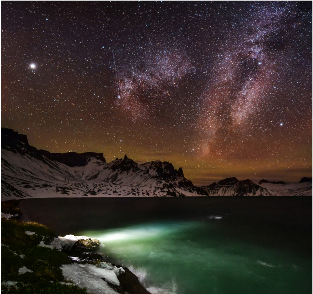
The Galaxy draped across the sky over Lake Chon