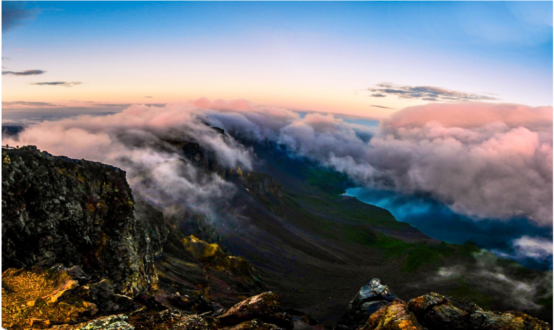
A veil of mist over Tangyol Peak