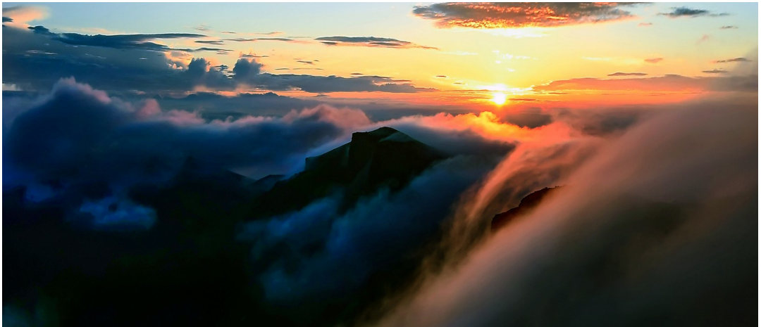
Mt Paektu at sunrise