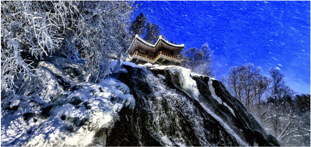
Rimyongsu Falls is not frozen even in midwinter.