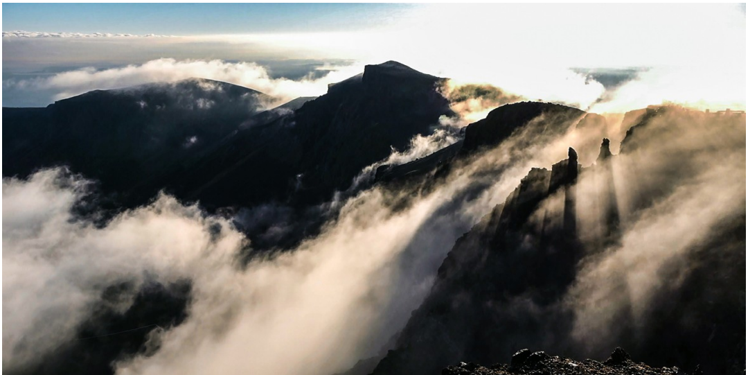
Mt Paektu veiled in morning mist