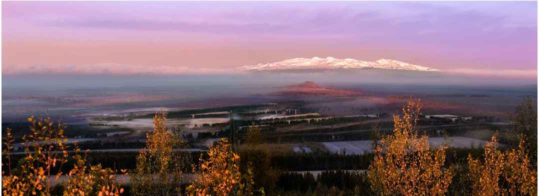
Taehongdan tableland in the morning