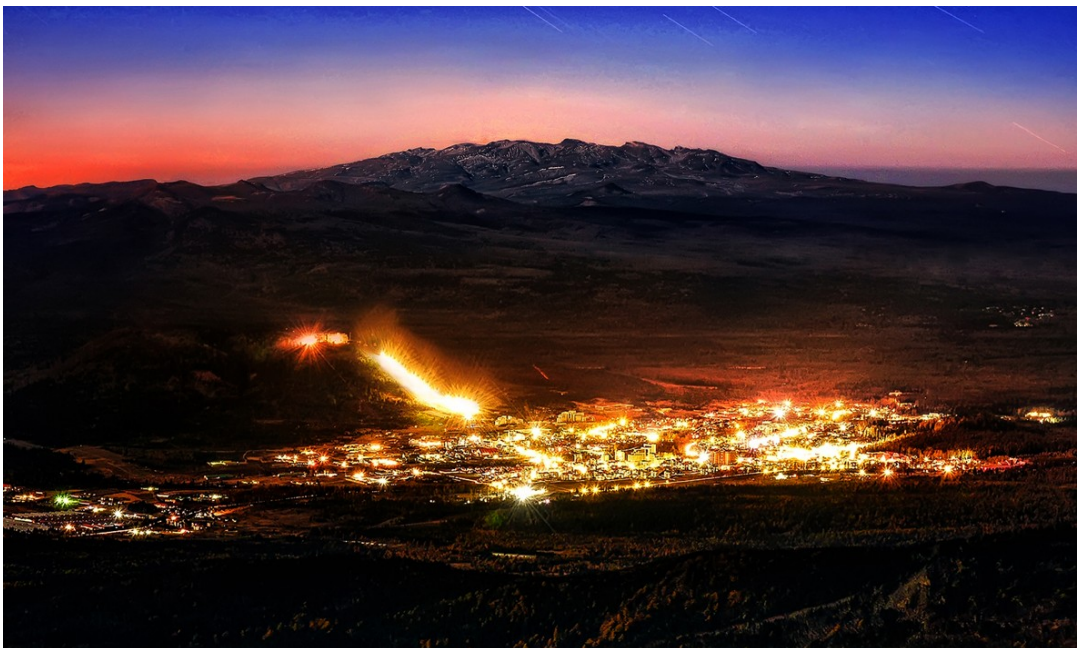
Brightly-lit Samjiyon City at the foot of Mt Paektu