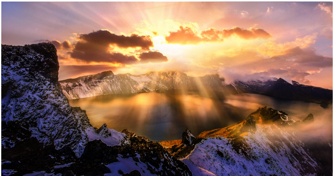
Mt Paektu tinged with glow