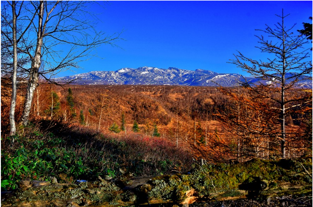
Mt Sono in autumn