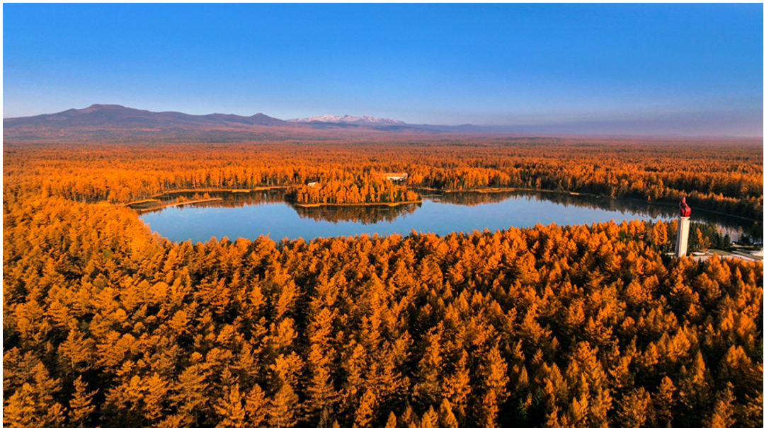
Lake Samji in autumn