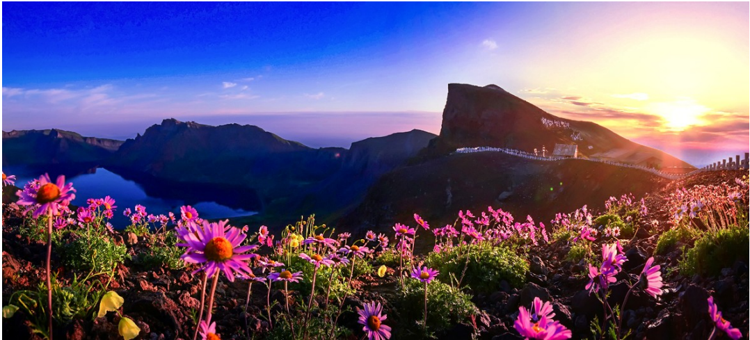
Mt Paektu in spring