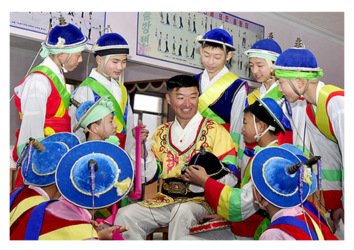
The students are learning the skills of Sangmo dance.