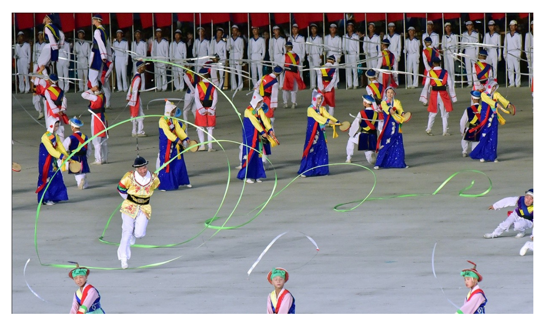
Sangmo dance was performed in various art shows including the grand mass gymnastics and artistic performance The Glorious Motherland (2018).