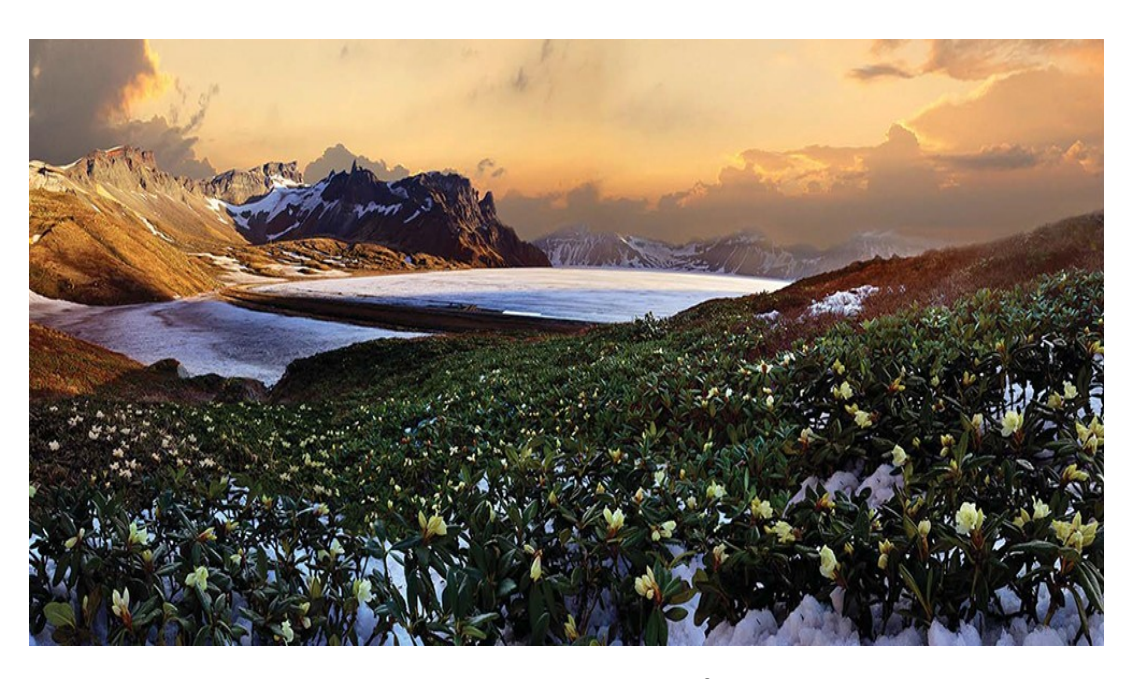
Rhododendrons on Lake Chon of Mt Paektu