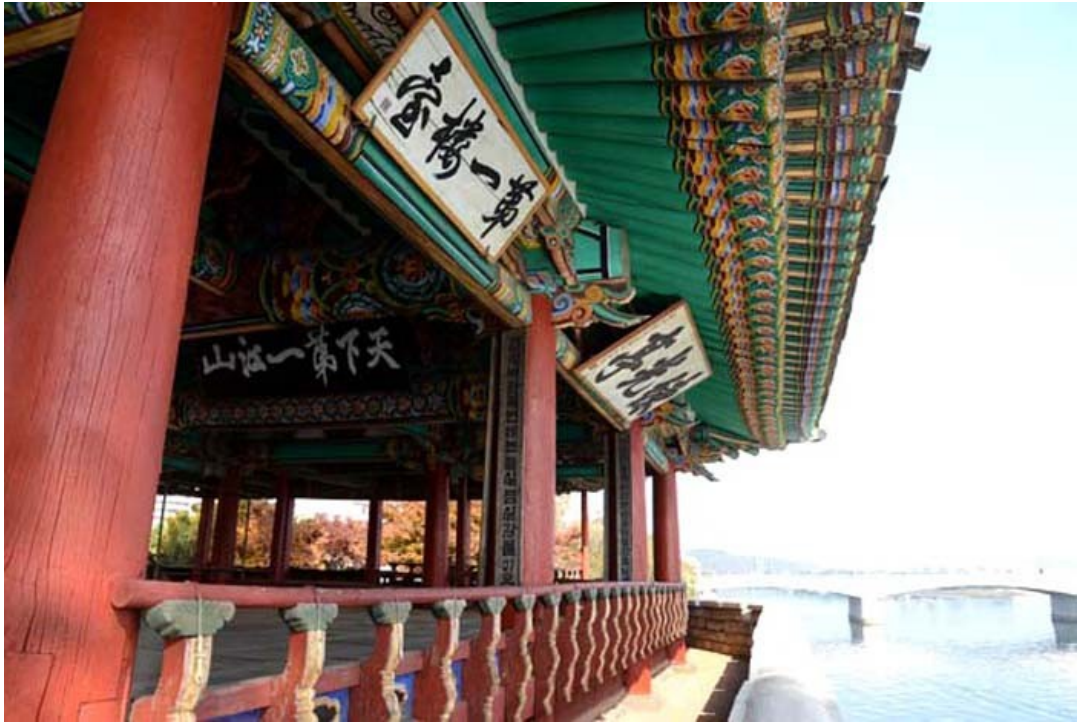
Colourful painting of historical relics