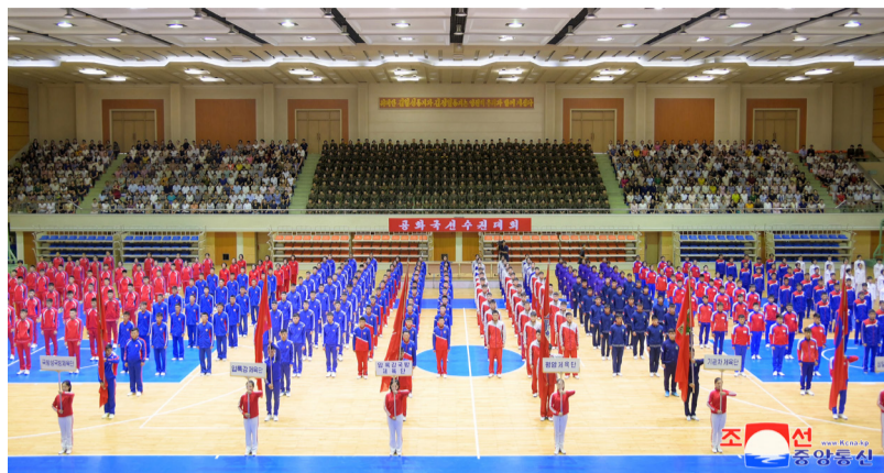
The DPRK Championships open at the Basketball Gymnasium on Chongchun Street in Pyongyang on September 6.