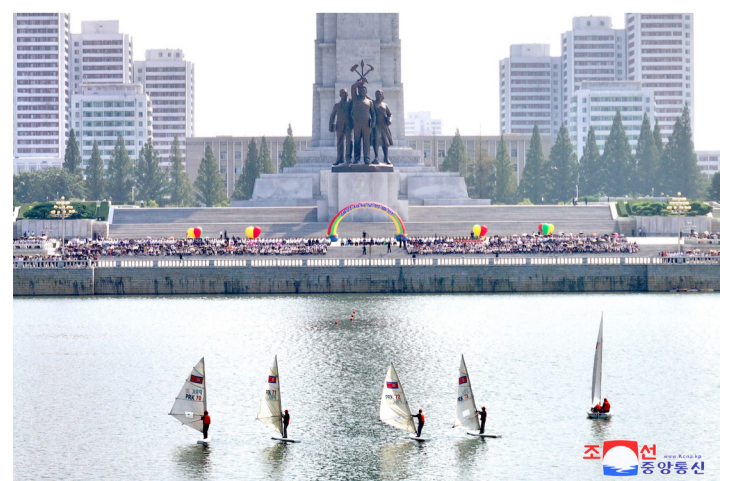
A maritime sports demonstration is held on the Taedong River in front of the Tower of the Juche Idea in Pyongyang on September 9.

There was also a demonstration of water skiers.