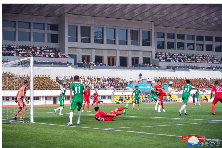
A scene from the men's football match between the April 25 and Amnonggang teams at Kim Il Sung Stadium on September 8.

The April 25 beat the Amnonggang 3-1 in the match.