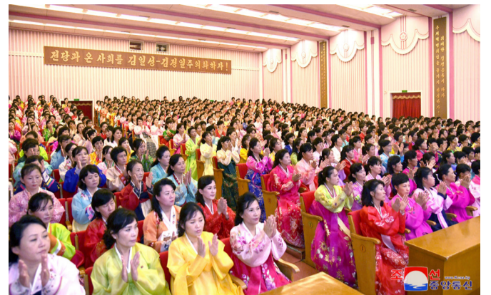
Women's union officials and members meet at the Hall of Women in Pyongyang on September 6 to celebrate the 76th founding anniversary of the DPRK.

The reporter and speakers said that the founding anniversary of the glorious DPRK is being greeted at a time when all the people of the country are waging courageous struggle for the comprehensive development of Korean-style socialism with confidence in sure victory under the wise leadership of the great Workers' Party of Korea