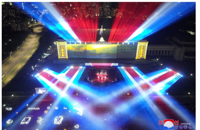
An art performance is given in celebration of the 76th founding anniversary of the Democratic People's Republic of Korea in Pyongyang on September 9.