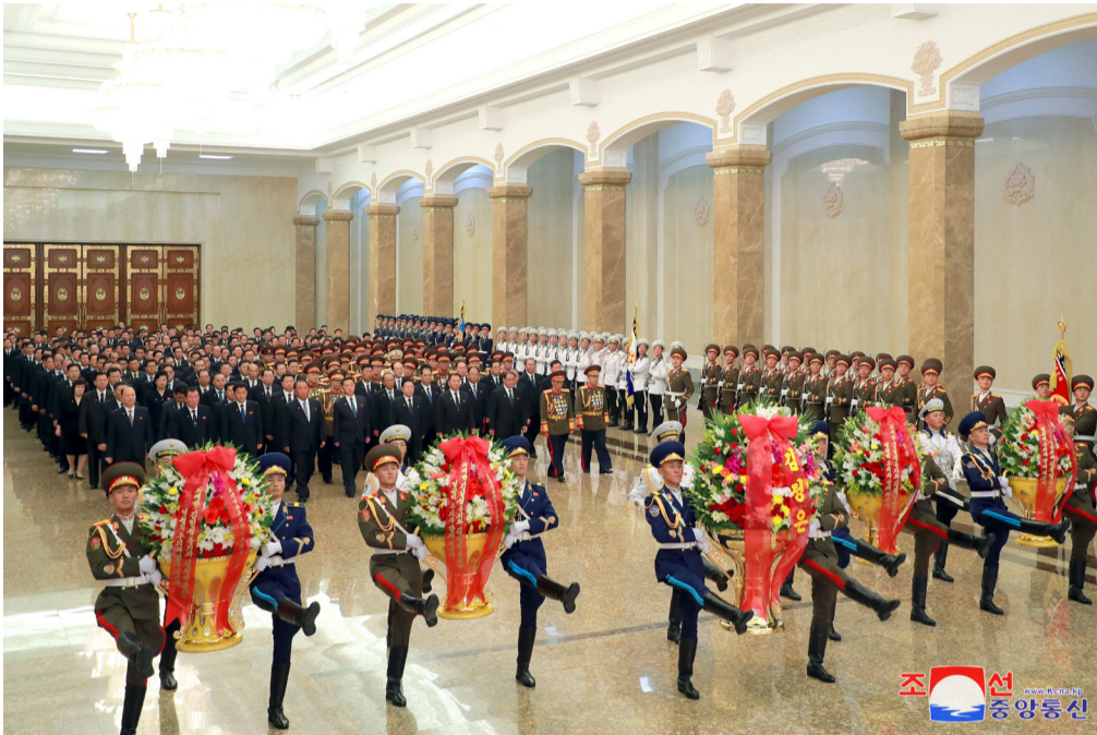
Senior Party and government officials, deputies to the Supreme People's Assembly and leading officials of armed forces organs visit the Kumsusan Palace of the Sun, the sacred temple of Juche, on September 8 on the occasion of the 76th birthday of the DPRK.