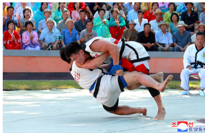
The 19th Grand Bull Prize National Ssirum Contest takes place at the national ssirum ground on Rungna Islet on September 5-6.

The trophy cup, medals and diplomas were awarded to winners.