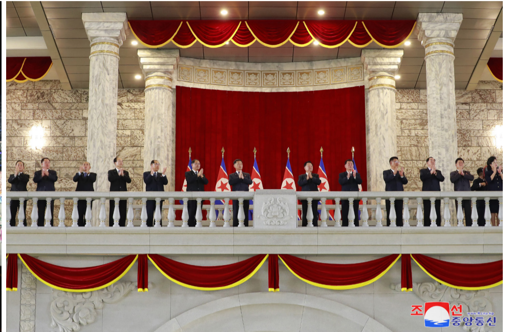
A meeting and an evening gala take place in Pyongyang on September 8 to celebrate the 76th founding anniversary of the DPRK.