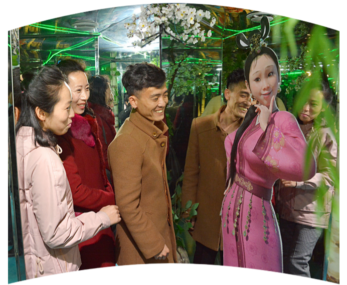
Various gadgets and VR technology help visitors experience a fantasy world at the mirror funhouse in the second section of the amusement park of the Rungna People's Recreation Ground.