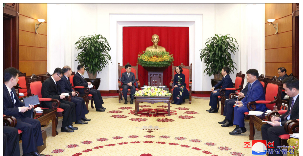
The head of the delegation of the Workers' Party of Korea meets with the standing secretary of the Secretariat of the Central Committee of the Communist Party of Vietnam in Hanoi on March 26.