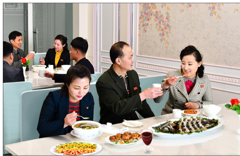
Various kinds of dishes are served to working people at the Delicacy House under Okryu Restaurant.

Many people visit the Delicacy House of the Okryu Restaurant to taste the special dishes enjoying the scenery of the picturesque Taedong River.