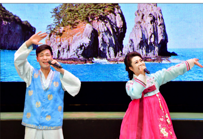
The National Acrobatic Troupe and the National Folk Art Troupe give a performance at the Pyongyang Circus Theatre.

be claimed to be the climax of the work, the audience applaud enthusiastically as they are lost in admiration.