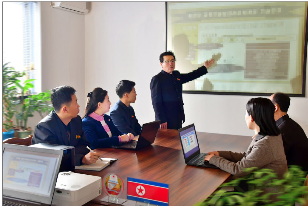
Researchers discuss how to boost the efficiency of sci-tech diffusion at the Sci-tech Diffusion and Management Research Institute.

Last year, too, it disseminated techniques for increasing agricultural productivity, including breeding of new crop varieties and relevant manuring and cultivation methods and data on efficient recycling techniques.