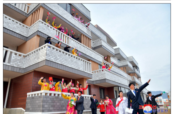
A meeting for moving into new houses takes place at the Kangdong Greenhouse Complex on March 27.