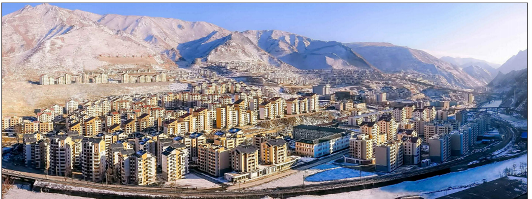
A bird's-eye view of the mountain-gorge city built in the Komdok area.

Every inhabitant in Komdok is determined to repay the favour of the country which provided ordinary miners with many new flats free of charge with increased mineral production.