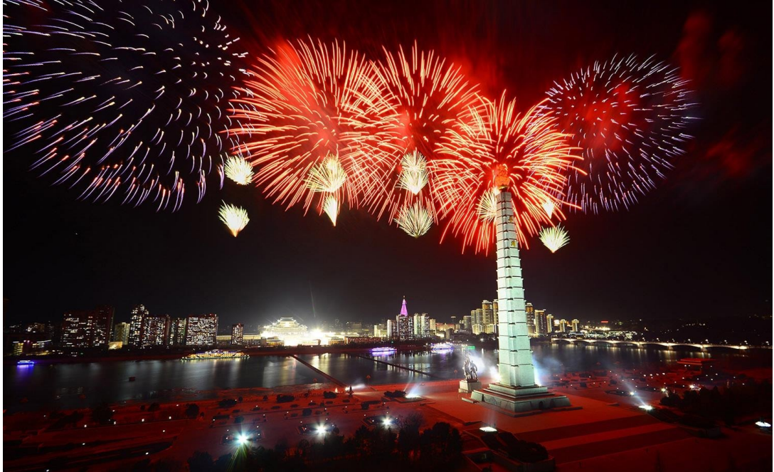
Tower of the Juche Idea