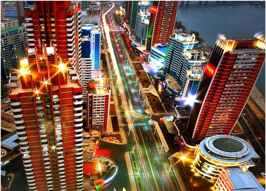
Mirae Scientists Street