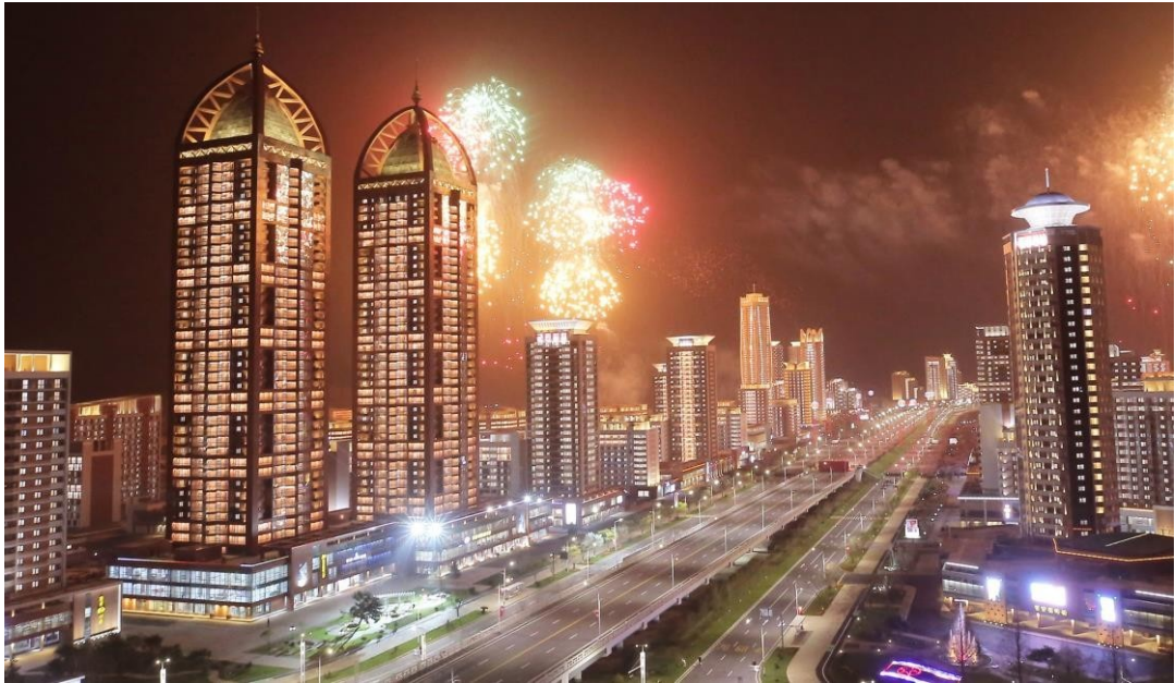
Hwasong Street completed in April 2023