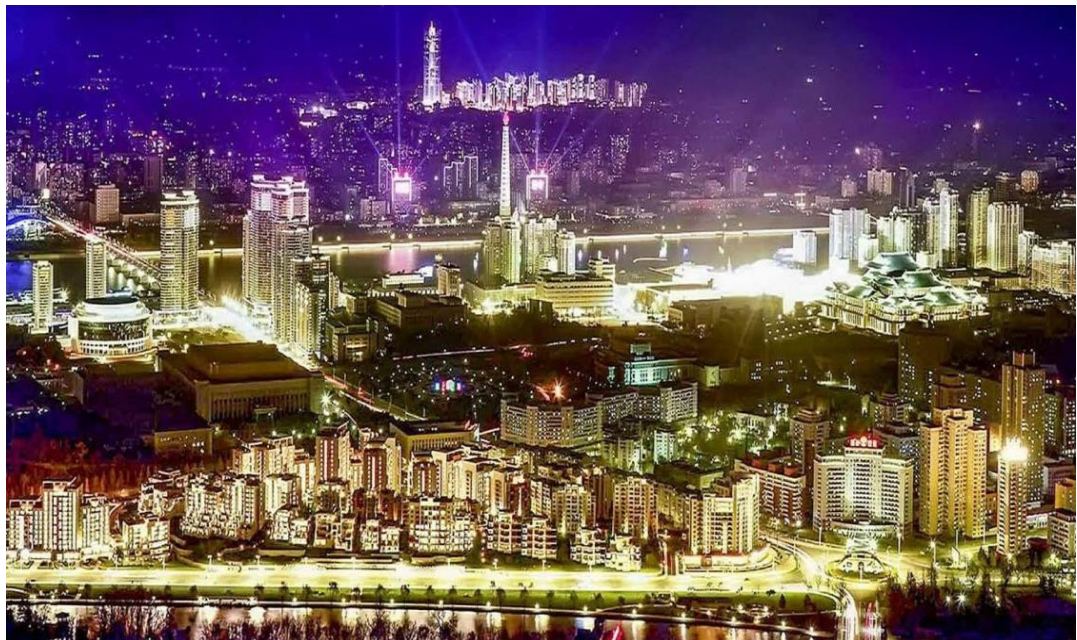
Part of Pyongyang at night