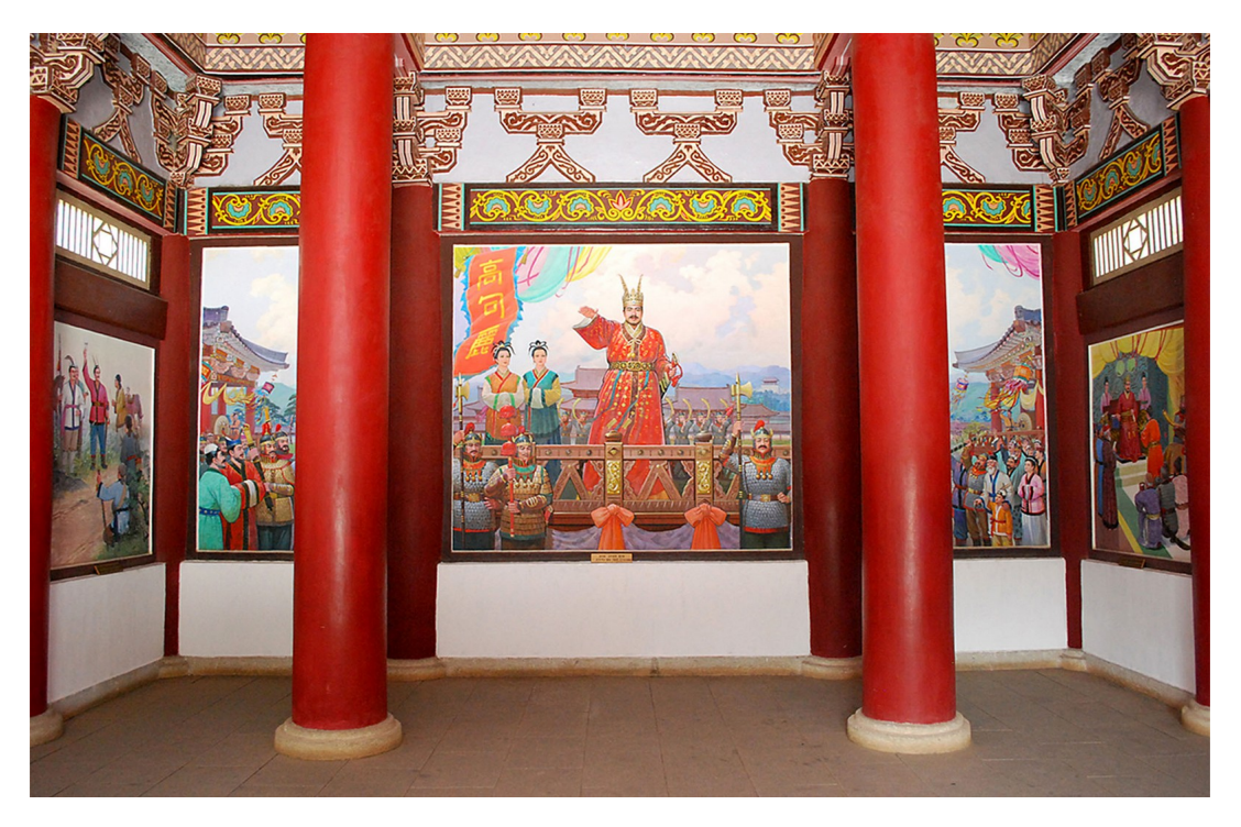
Some of the pictures of King Tongmyong in the memorial service hall