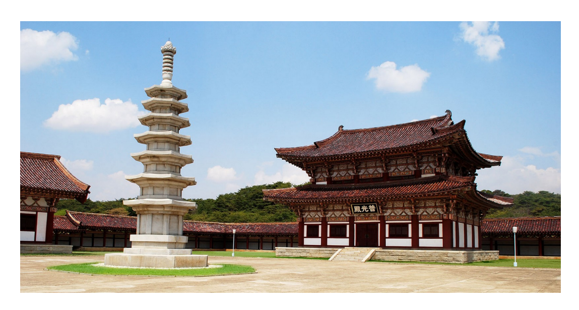
Jongrung Temple where the people of Koguryo used to pray for the soul of King Tongmyong