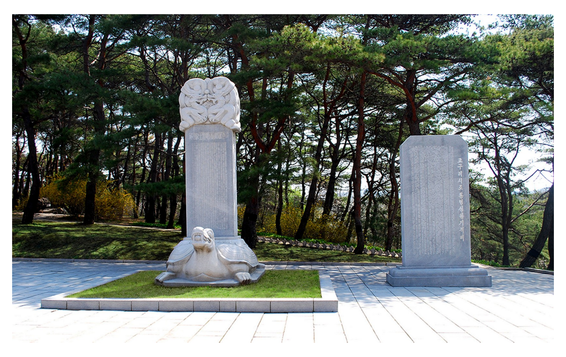
Stele dedicated to King Tongmyong, and a monument to his achievements standing in the lower part of the tomb section