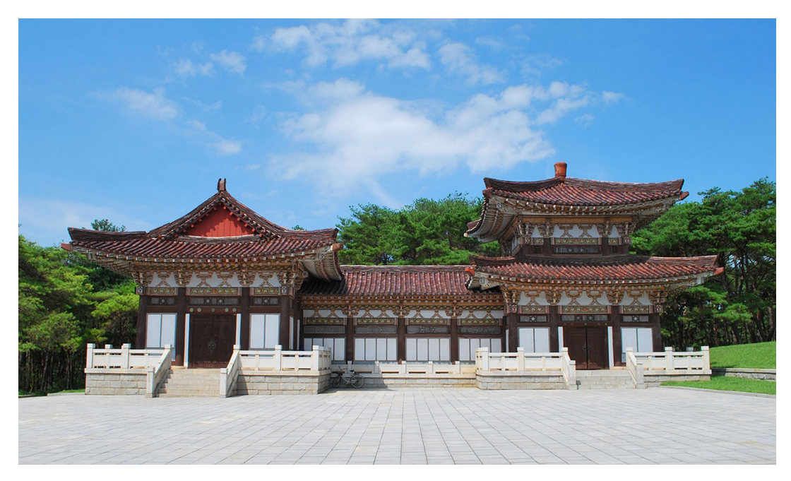
Memorial service hall where sacrificial offerings to King Tongmyong were prepared