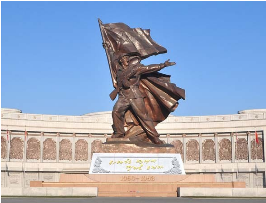
The main-theme statue “Victory” of the Monument to the Victorious Fatherland Liberation War in Pyongyang, the capital of the DPRK