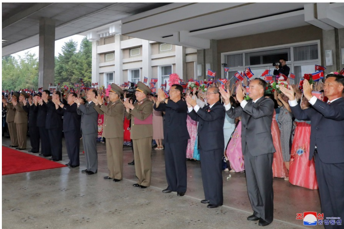
Pyongyang, September 12 (KCNA) -- Kim Jong Un , general secretary of the Workers' Party of Korea (WPK) and president of the