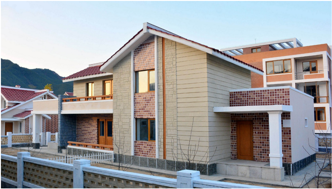
Recently new houses have been built in rural communities from highlands to lowlands.