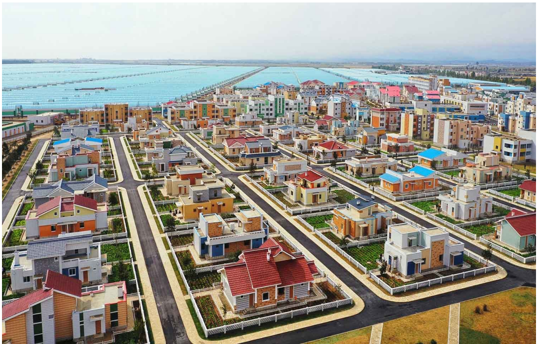
Ryonpho Greenhouse Farm and village built on the east coast of Korea