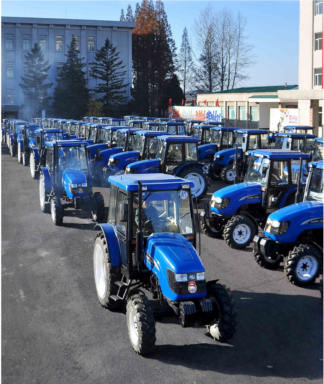
The DPRK produces modern farm machines including tractors by its own efforts.