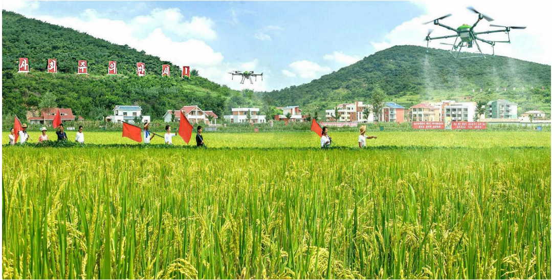
Agricultural workers are optimistic about a better future.