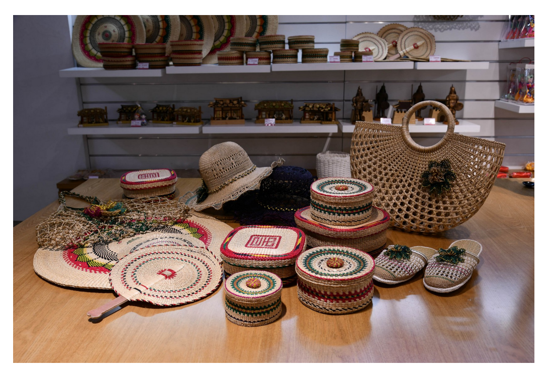
Some of grasswork products made in the DPRK