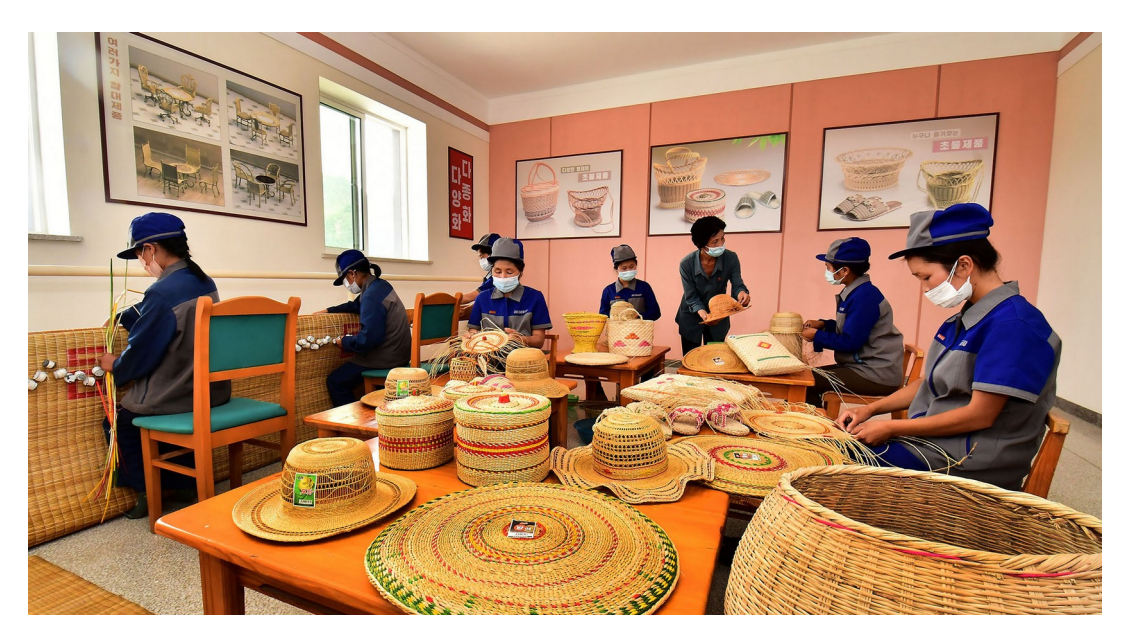
Employees work at a daily necessities factory in Kimhwa County.