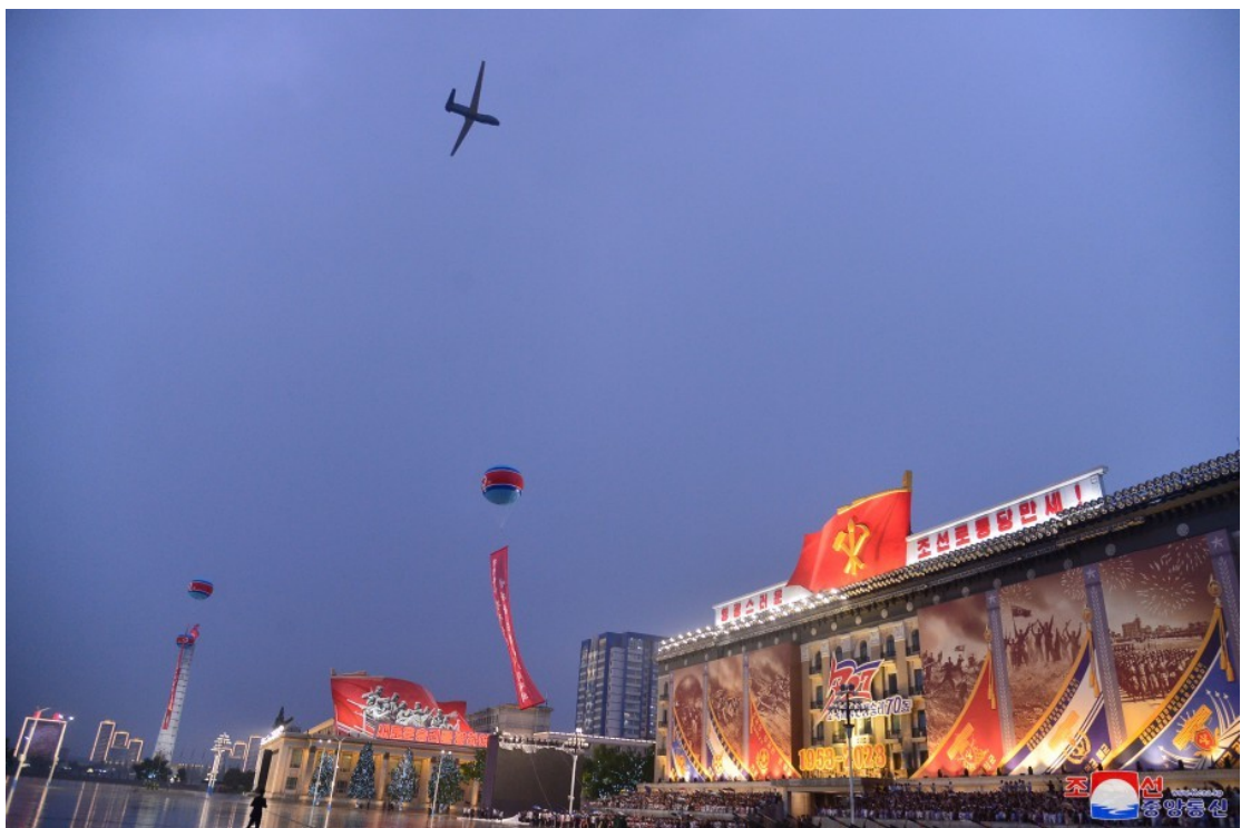
Pyongyang, July 28 (KCNA) -- The 70th anniversary of the victory in