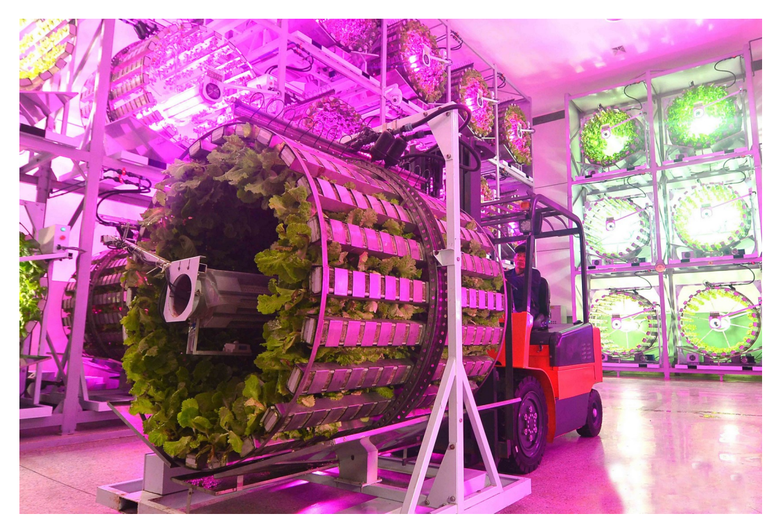
An employee harvests the first batch of vegetables over 10 days after inauguration.