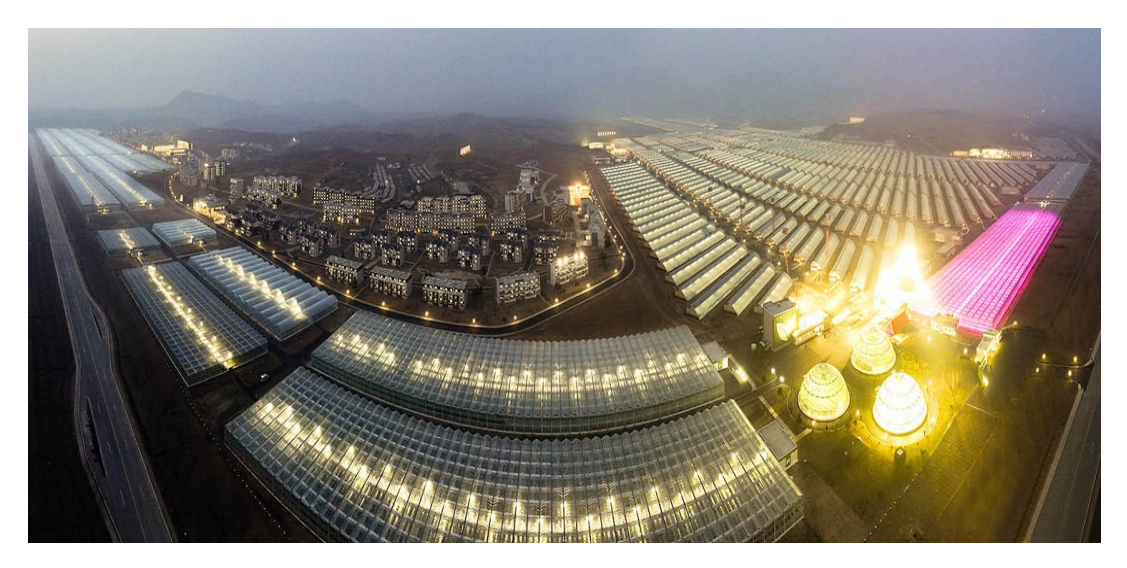
Modern greenhouses, production and service buildings, and terraced farmhouses unfold a spectacular scenery.