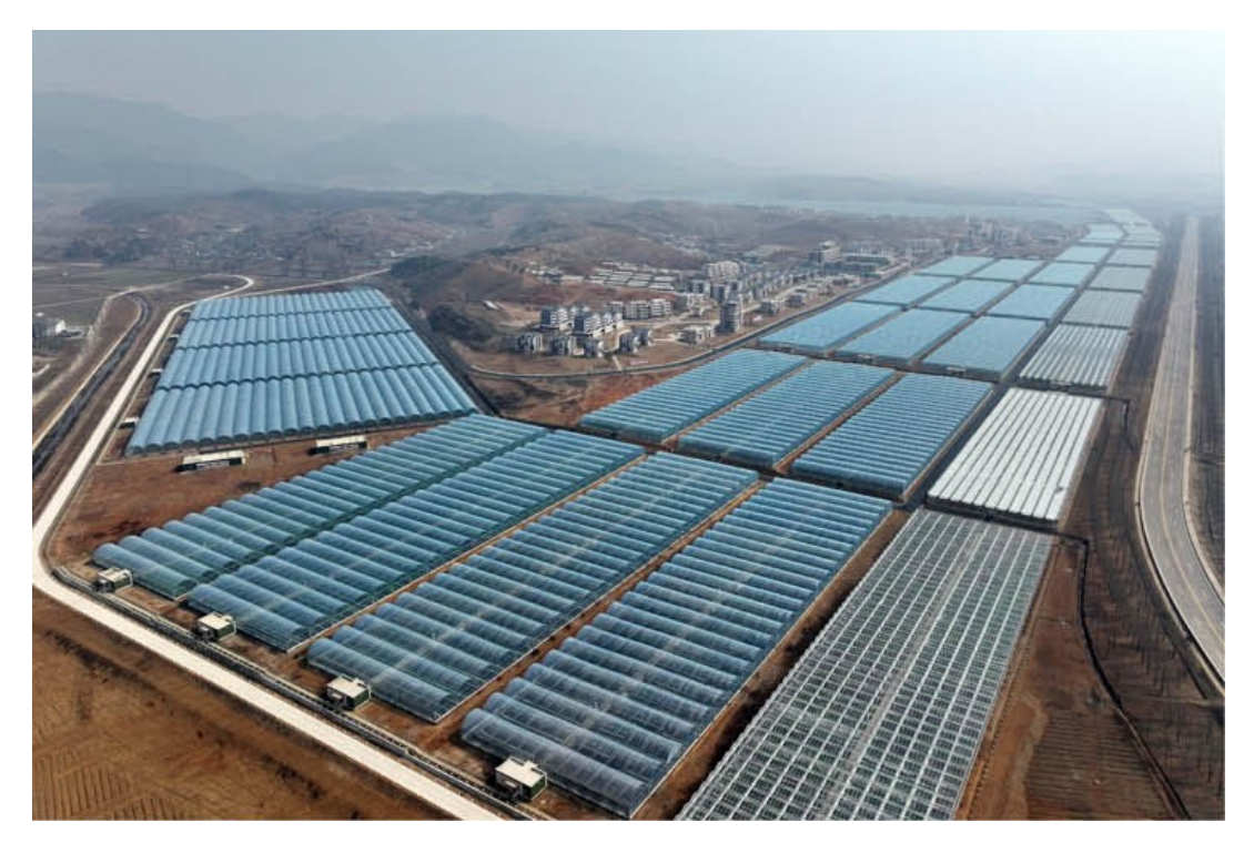
A "greenhouse town" or "farm town" in Pyongyang's Kangdong area