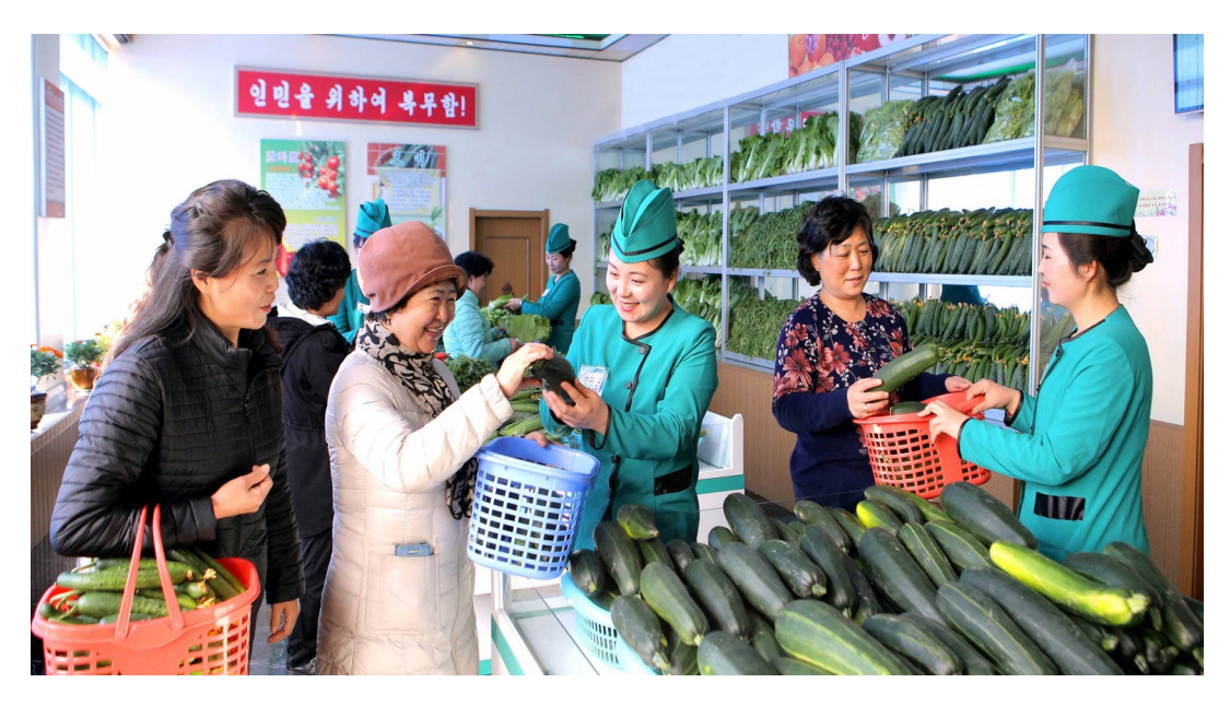
Pyongyang citizens are happy with fresh vegetables.