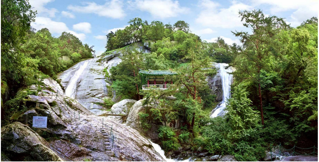
Ryongyon Falls (left) and Sanju Falls (right)