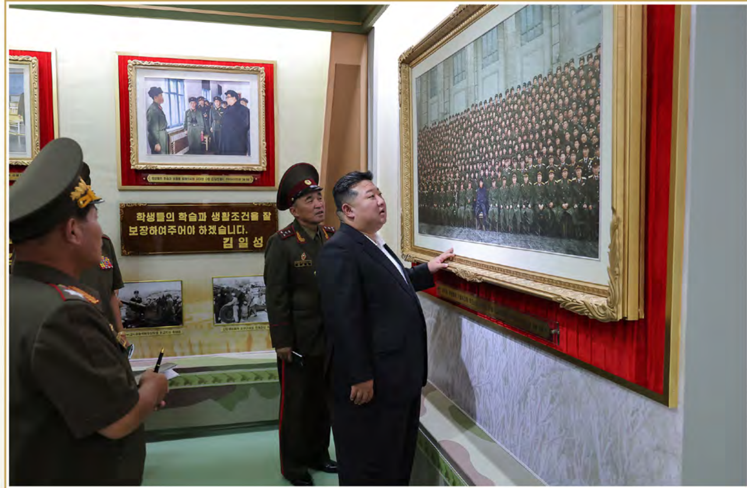
Guided by senior officials, he went round the arms study room and watched drill lectures given at the ground-based artillery firing research room and the artillery tactical research room. Then at the combined pedagogical information control room he learned in detail about the updating of education.