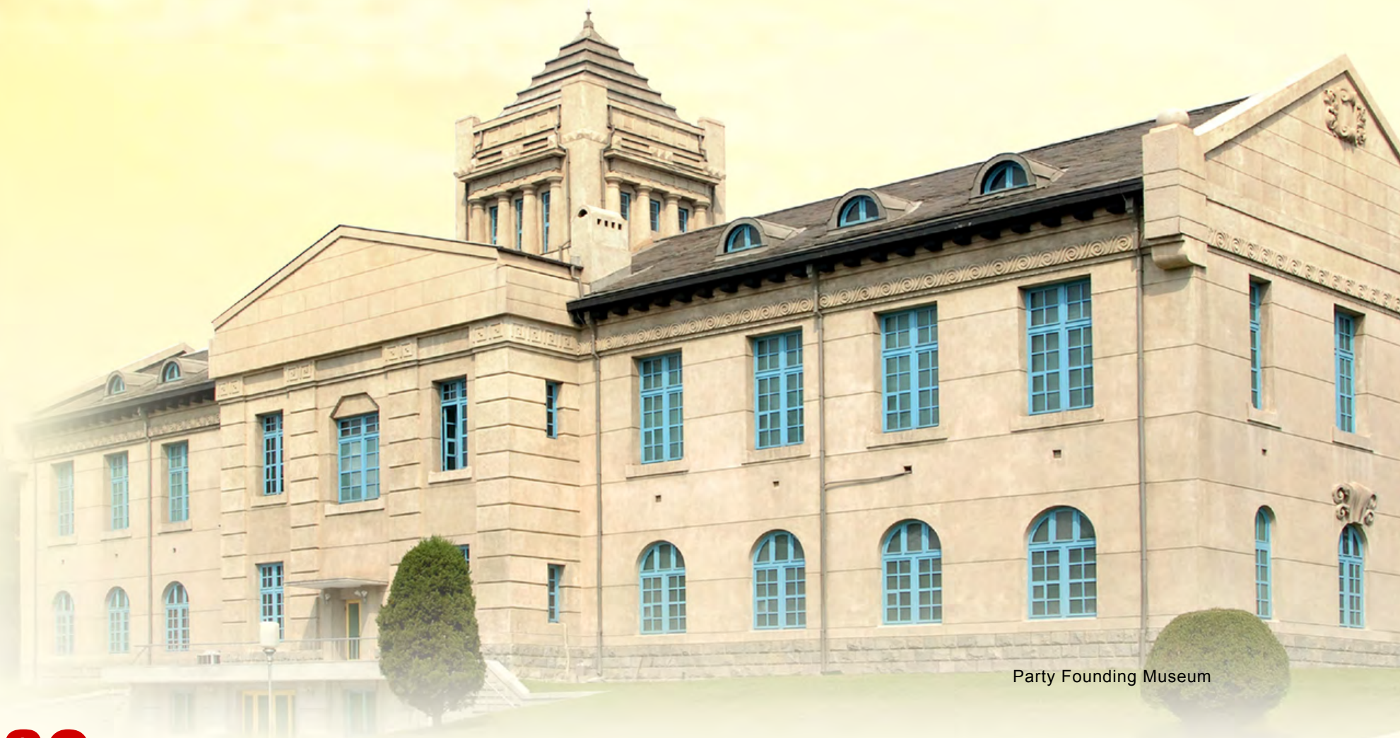
Party Founding Museum

Proclamation of the founding of a revolutionary party of Juche type