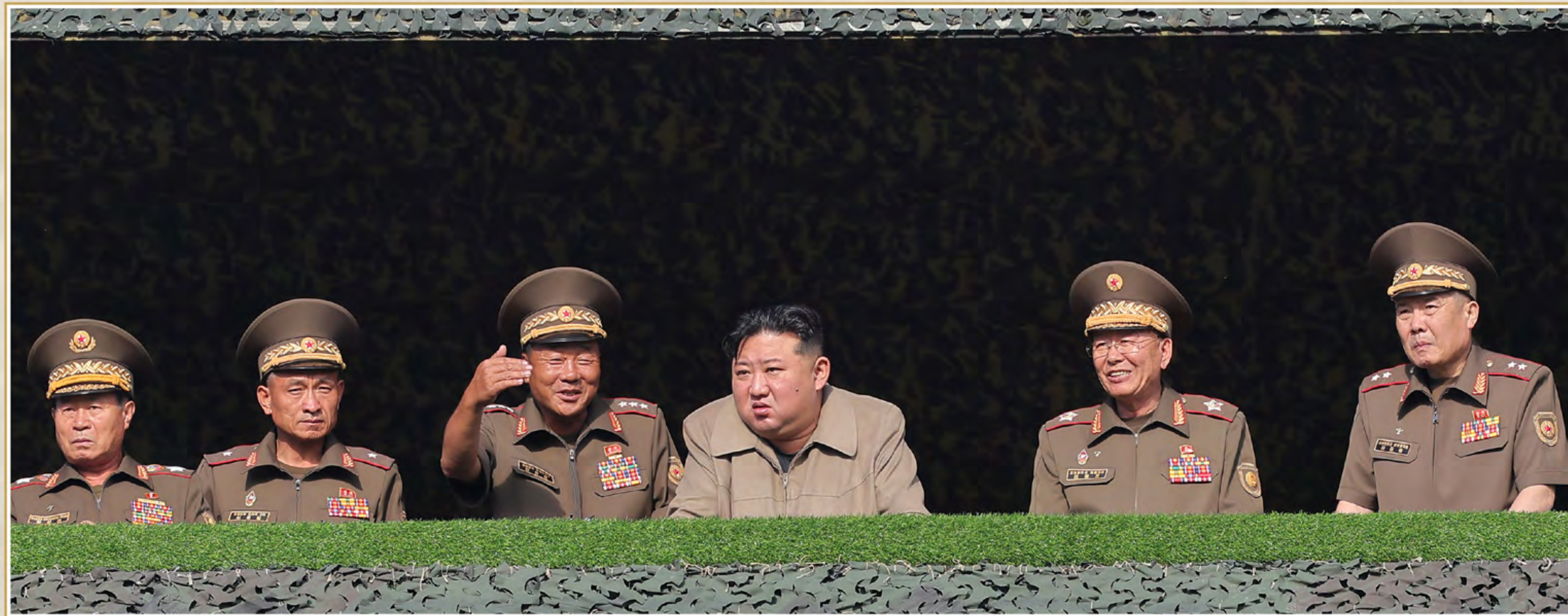
Kim Jong Un mounted the observation post to watch the combatants conducting a drill of scouting and raiding objects according to a training programme.

Kim Jong Un, general secretary of the Workers' Party of Korea and president of the State Affairs of the Democratic People's Republic of Korea, inspected the training base of the special operation forces of the Korean People's Army to guide the drill of combatants on September 11.