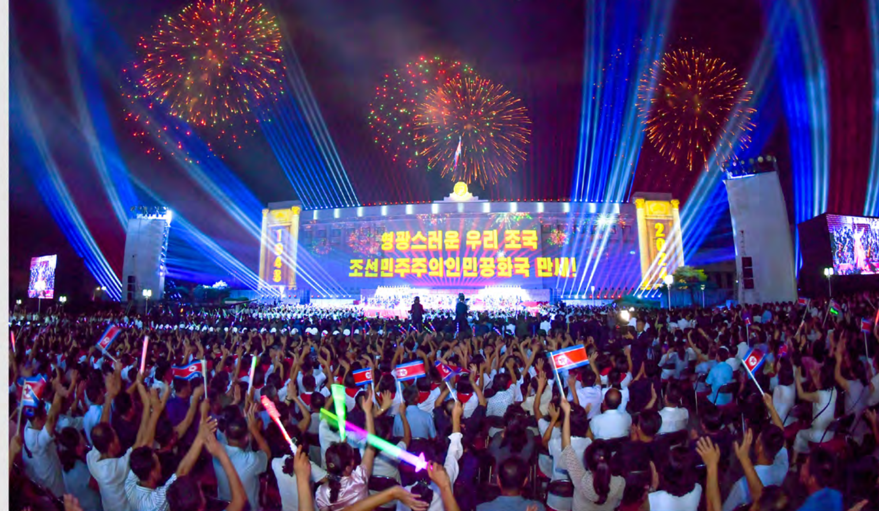
Grand artistic performance in celebration of the founding anniversary of the DPRK took place in the capital city of Pyongyang.

An artistic performance was given in the capital city of Pyongyang