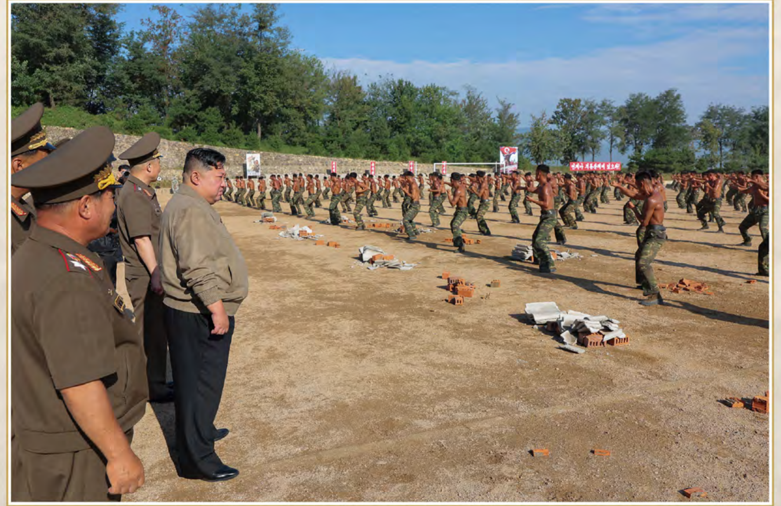
Looking with satisfaction at the soldiers, who were sweeping the training ground like lightning, being well versed in the Juche-based and modern combat methods, he highly praised all the combatants for thoroughly maintaining the sure war posture after growing up as stout and brave a-match-for-a-hundred combatants through revolutionary and intensive training.