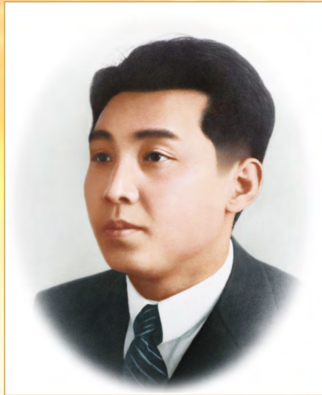
Great leader Comrade Kim Il Sung, founder of the Workers' Party of Korea