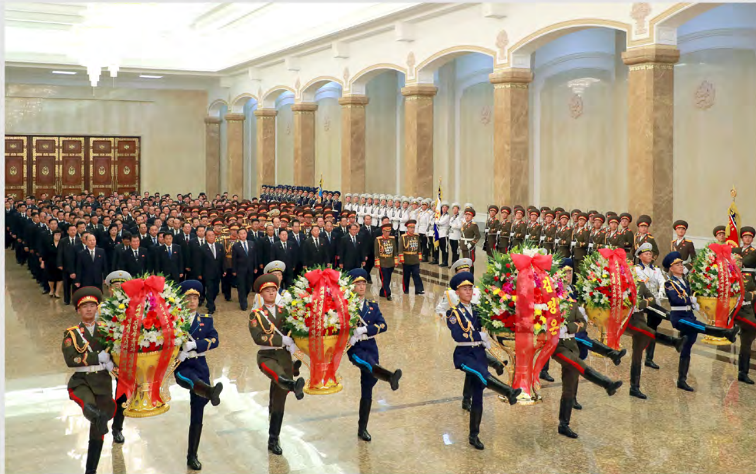
Party and government cadres visited the Kumsusan Palace of the Sun to pay noble tribute.