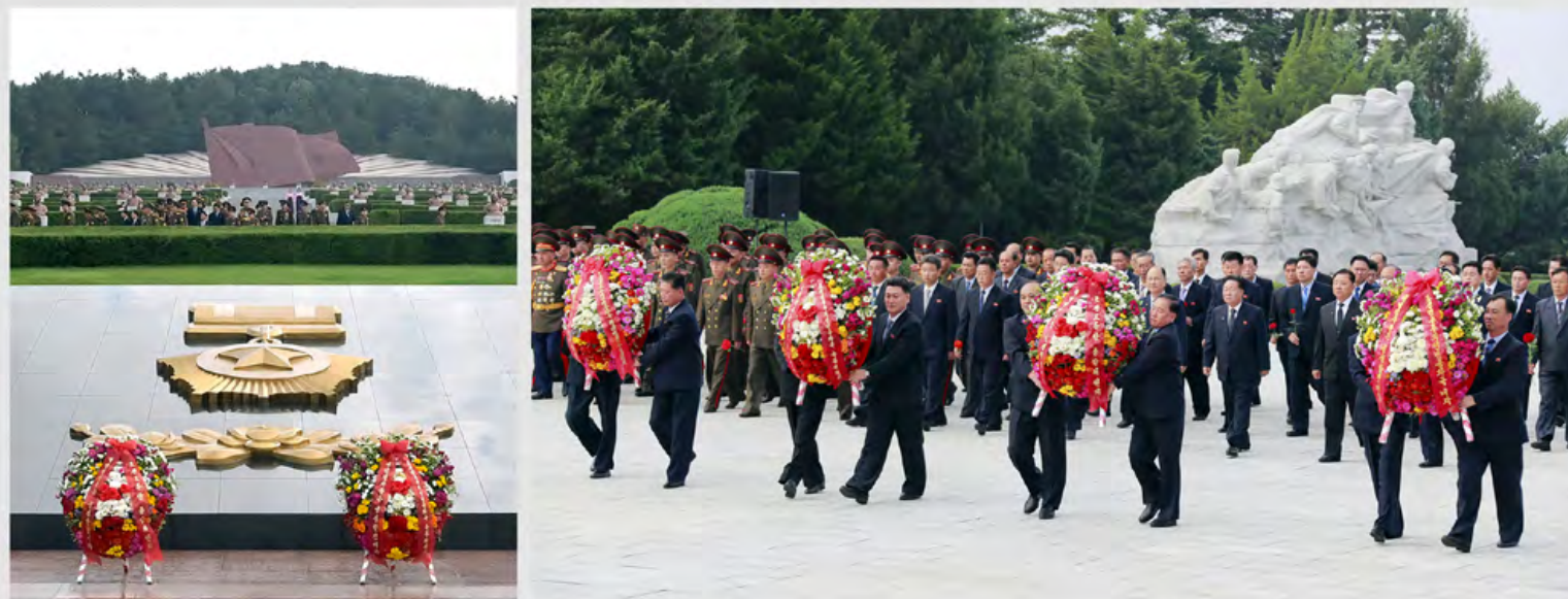
Wreaths were laid at the Revolutionary Martyrs Cemetery on Mt Taesong, Patriotic Martyrs Cemetery in Sinmi-ri, and Fatherland Liberation War Martyrs Cemetery.

A meeting and an evening gala took place in Pyongyang, the capital city, on September 8 to celebrate the 76 th founding anniversary of the DPRK.