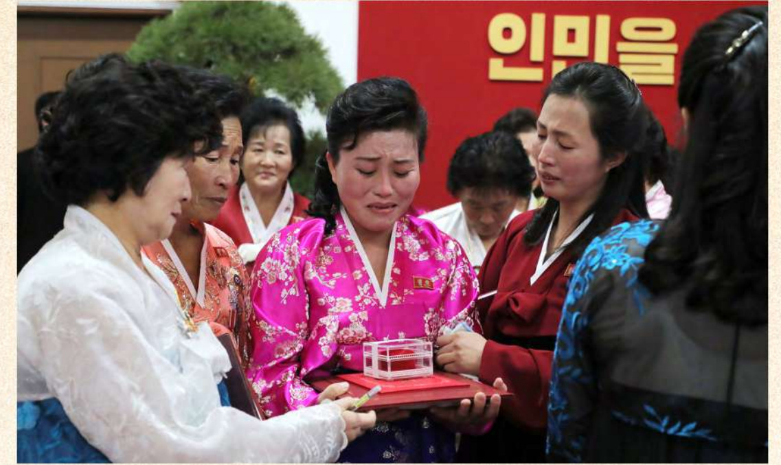
The newly-enacted Communist Mother Honour Prize awarded to the women who have made distinguished contributions to the prosperity of the country