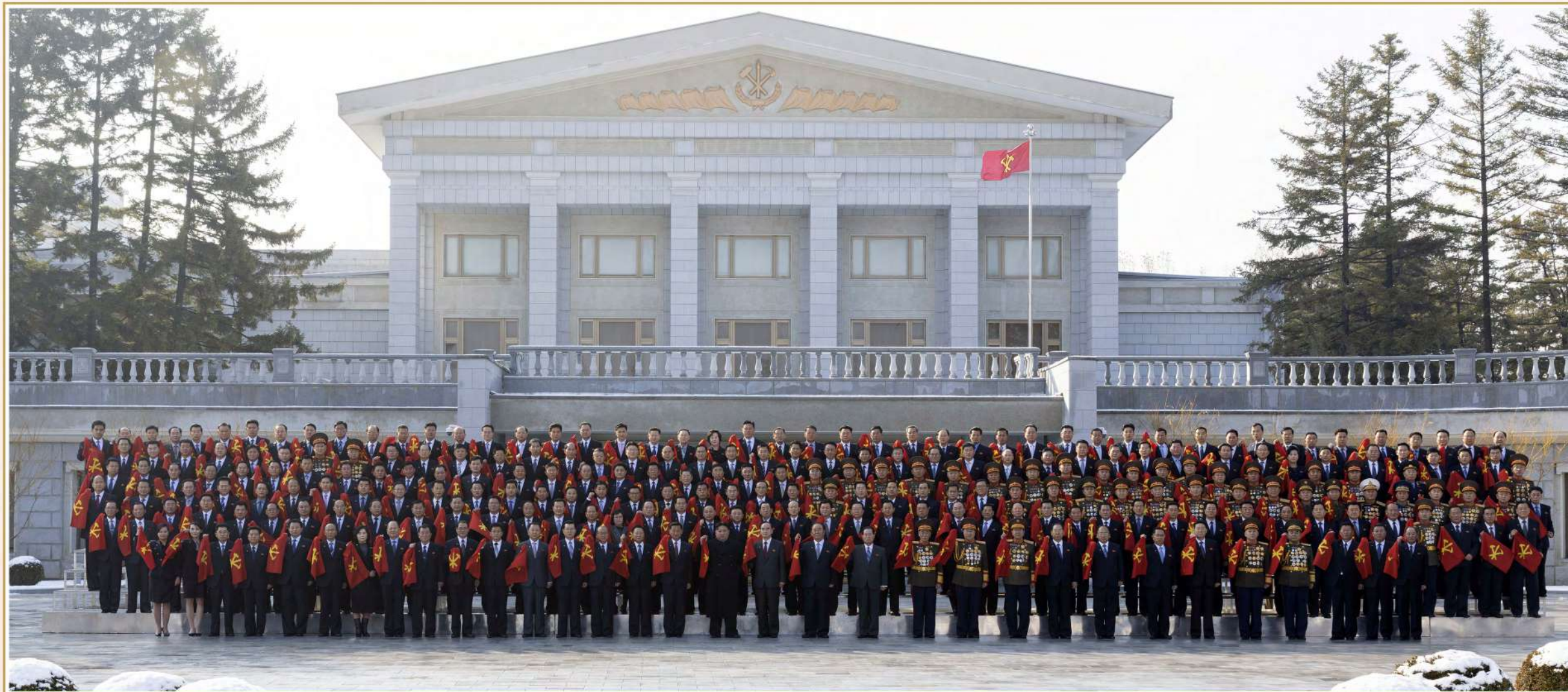
Kim Jong Un has a significant photo session with members of the leadership body of the Party Central Committee.