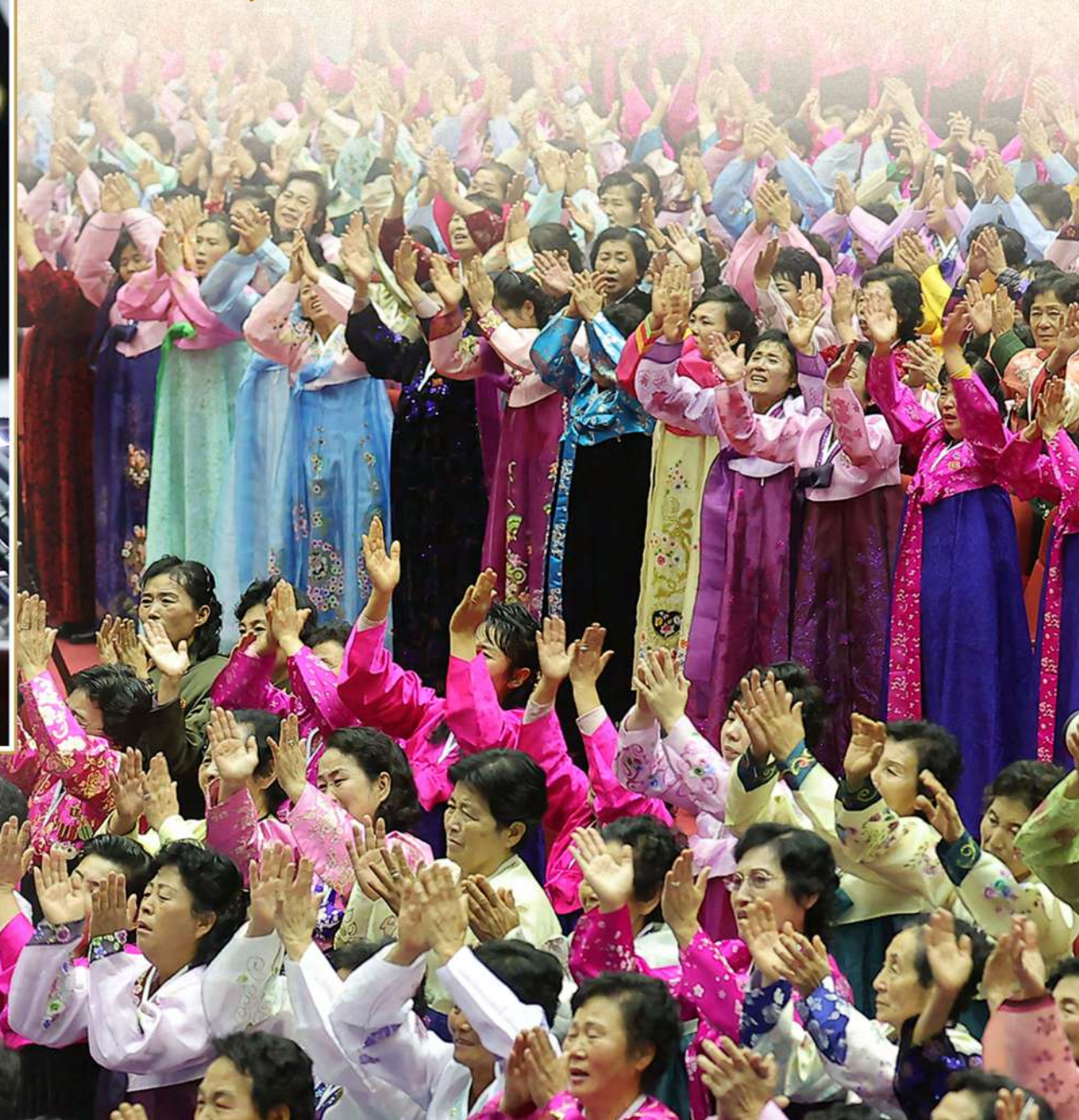
Kim Jong Un, general secretary of the Workers' Party of Korea and president of the State Affairs of the DPRK, attends the conference.

Saying that the small family groups the mothers have built up with such care out of a feeling of patriotism constitute a cornerstone that firmly supports the country, thanks to which the great socialist family remains solidly united and the country continues to grow in strength and highly appreciating that this is an enduring exploit performed by the mothers in Korea for the Party, the revolution and the country, Kim Jong Un, on behalf of the Party Central Committee and the Government of the Republic, offers his heartfelt gratitude and best wishes to all those present at the conference and to all other mothers in the country.