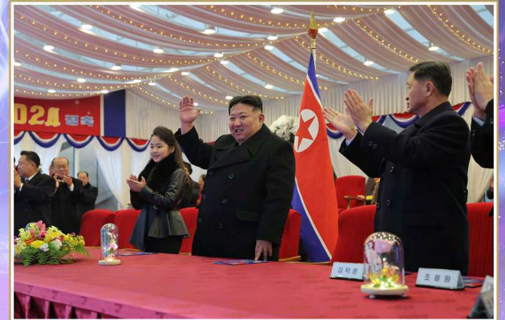
Kim Jong Un waves back to the enthusiastically cheering crowds as a token of his warm greeting of best wishes to all the audience and all the beloved people of the country seeing in the New Year.

He waved back to the enthusiastically cheering crowds as a token of his warm greeting of best wishes to all the audience and all the beloved people of the country seeing in the New Year.