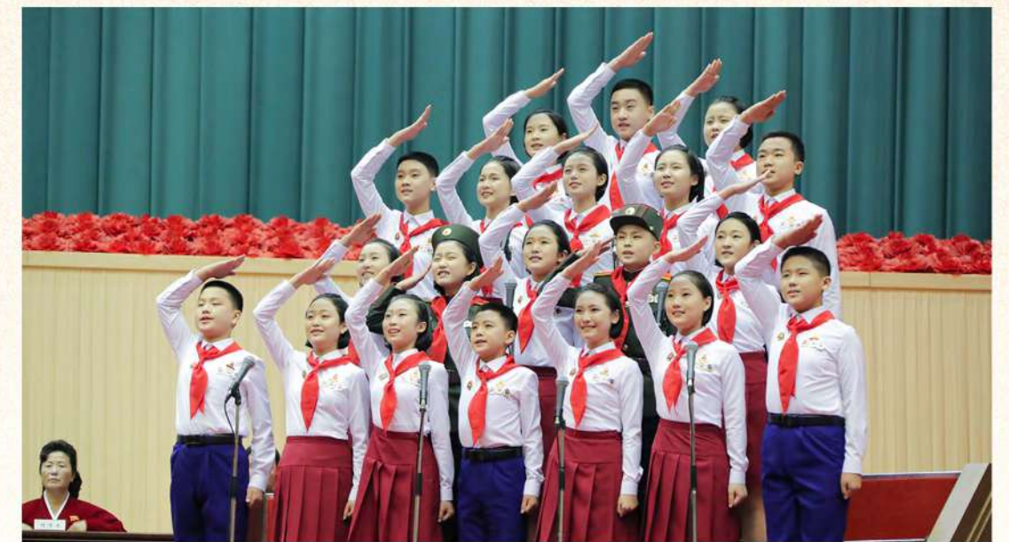
The congratulatory group of the Korean Children's Union reciting a congratulatory poem "We extend glory to the great mother"

socialist construction and a changed ideal society to come in near future.