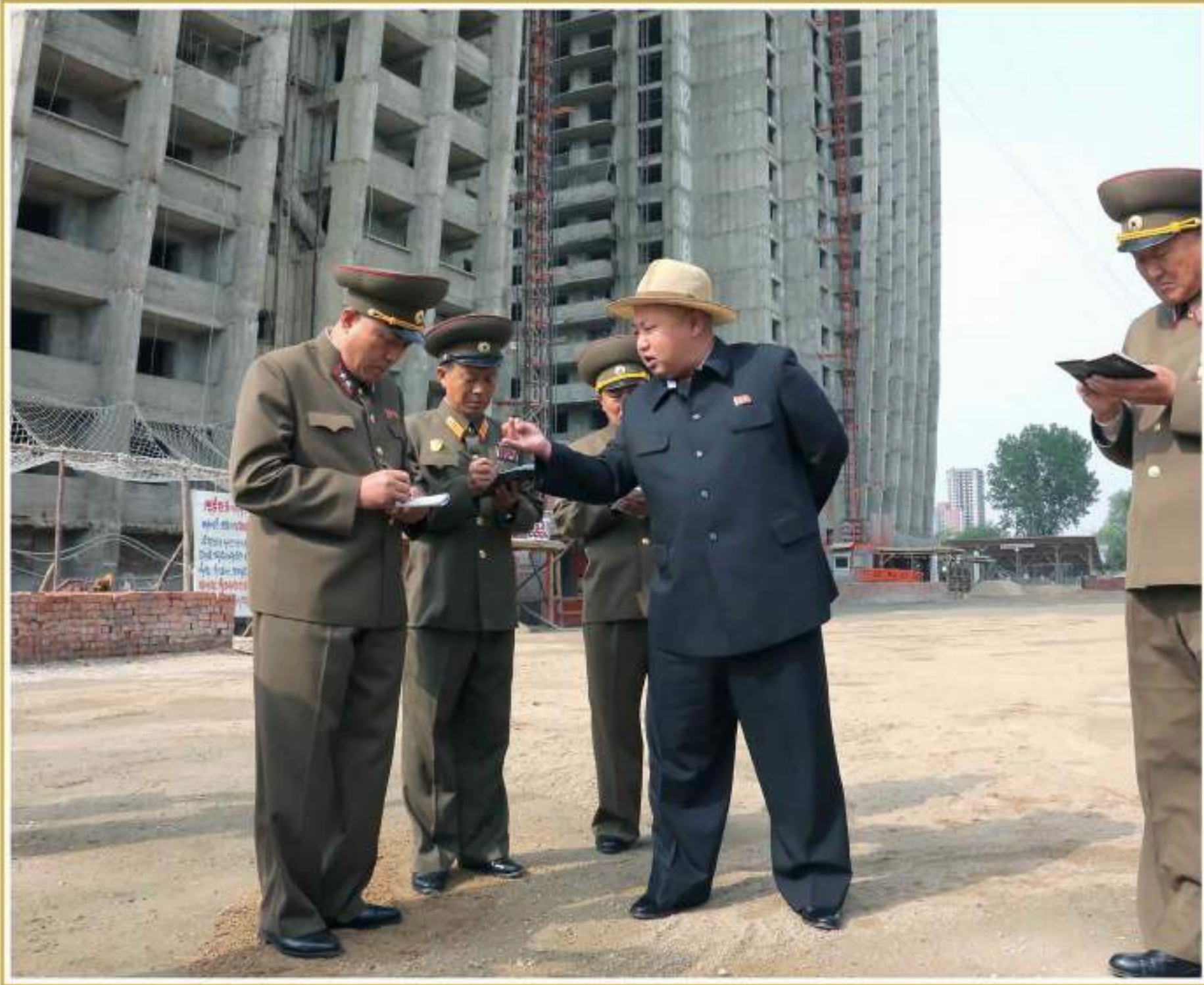
Kim Jong Un visits the construction site of apartment houses for teachers of Kim Chaek University of Technology in May Juche 103 (2014).