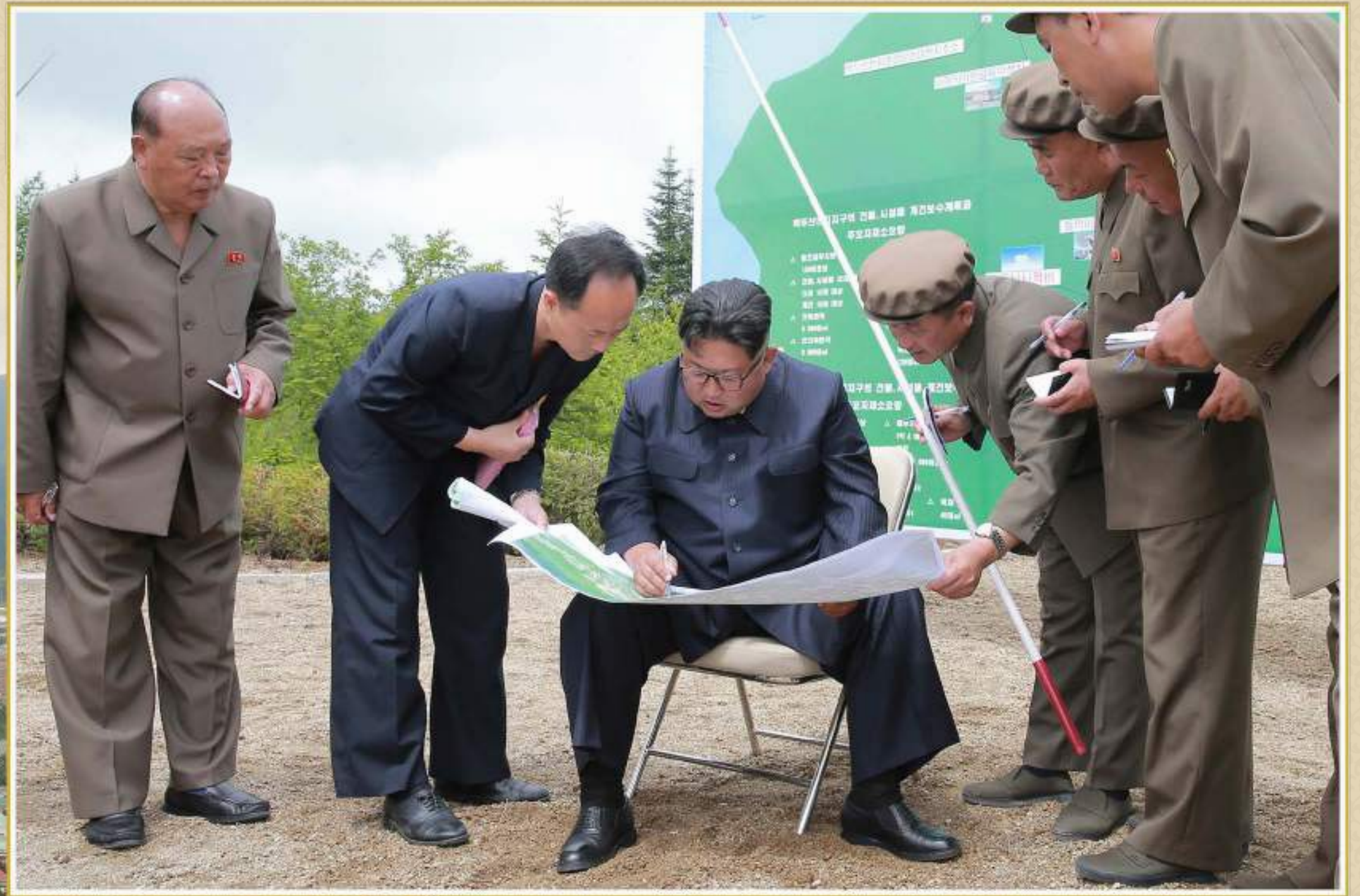
Kim Jong Un gives on-site guidance at construction sites in Samjiyon County in July Juche 107 (2018).

During the days of construction, he went over more than 11 360 artist's impressions.