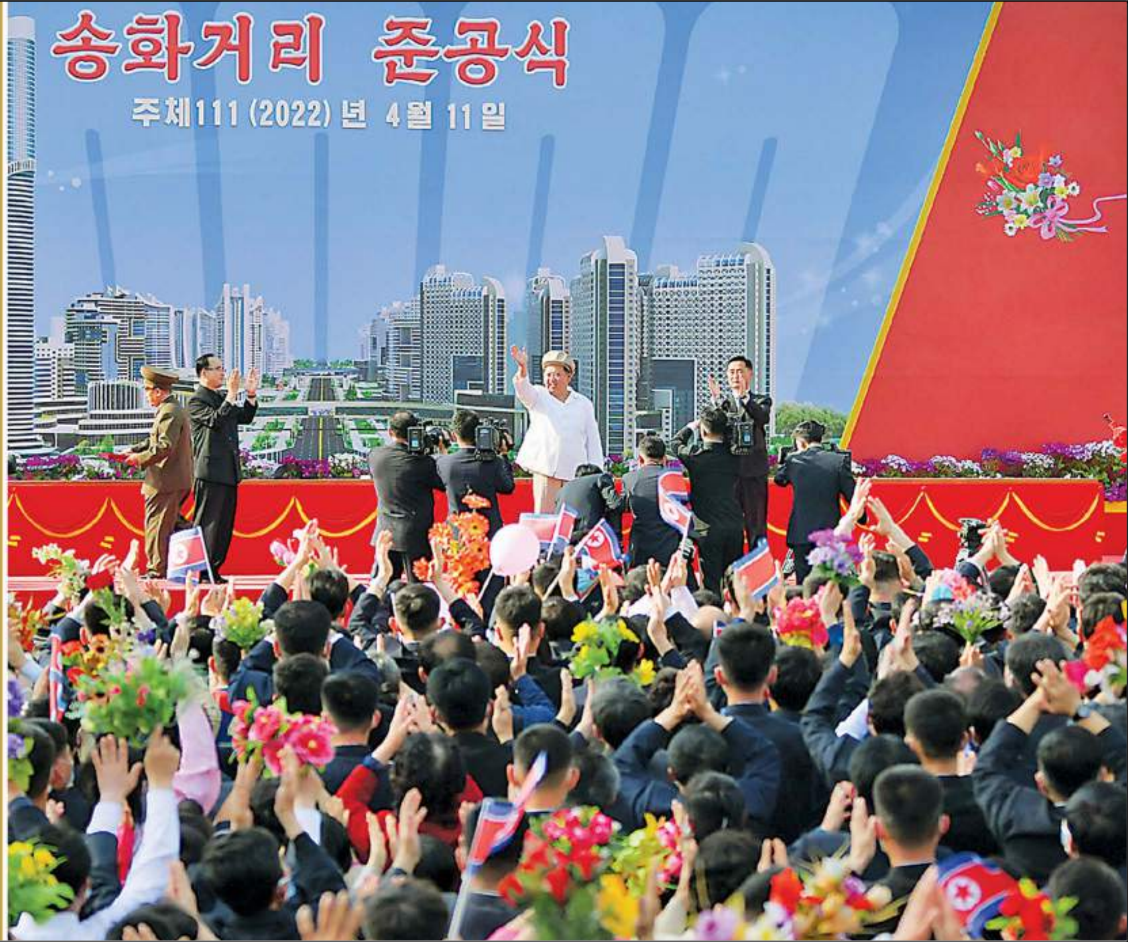
Kim Jong Un cuts the tape at the inauguration ceremony of Songhwa Street in April Juche 111 (2022).