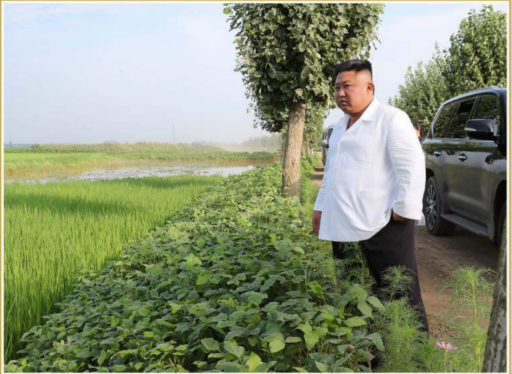
Kim Jong Un visits the flood-hit Taechong-ri area, Unpha County, North Hwanghae Province, in August Juche 109 (2020).