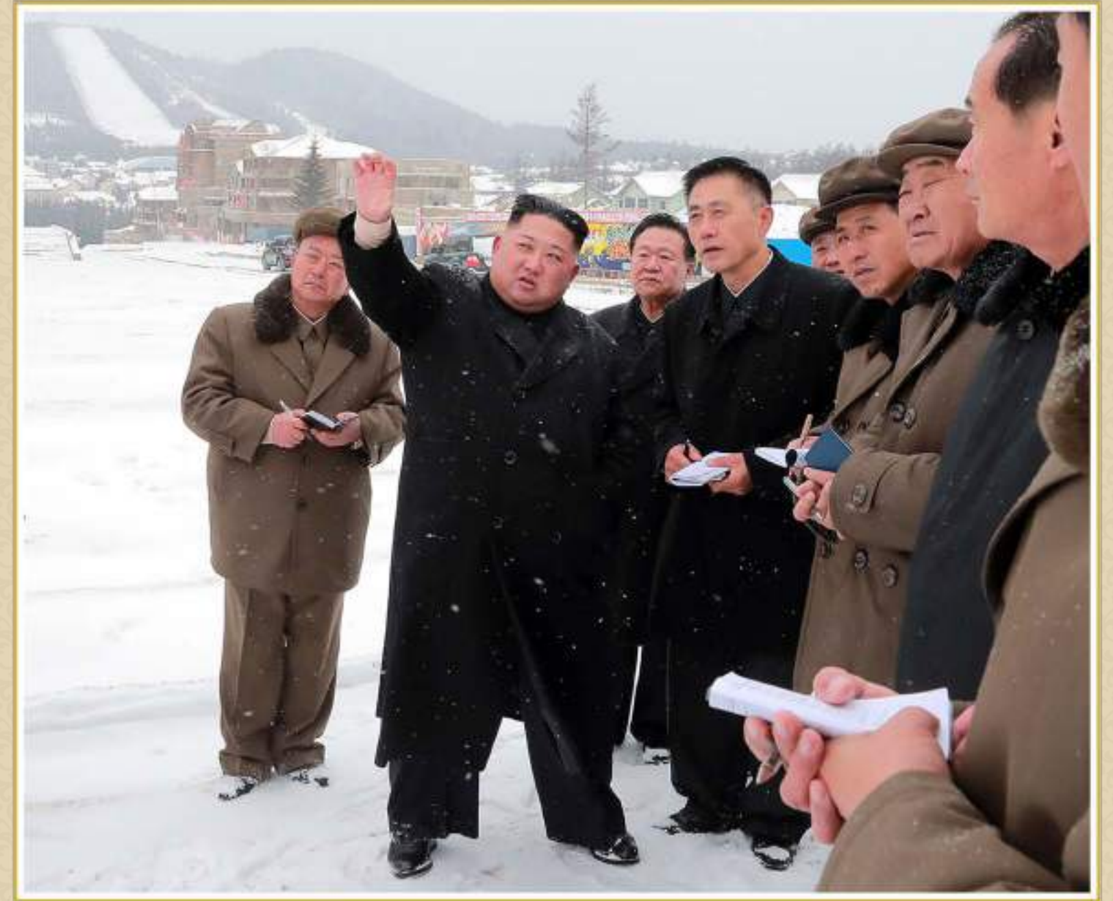
Kim Jong Un acquaints himself with the construction of the Samjiyon County town in October Juche 107 (2018).