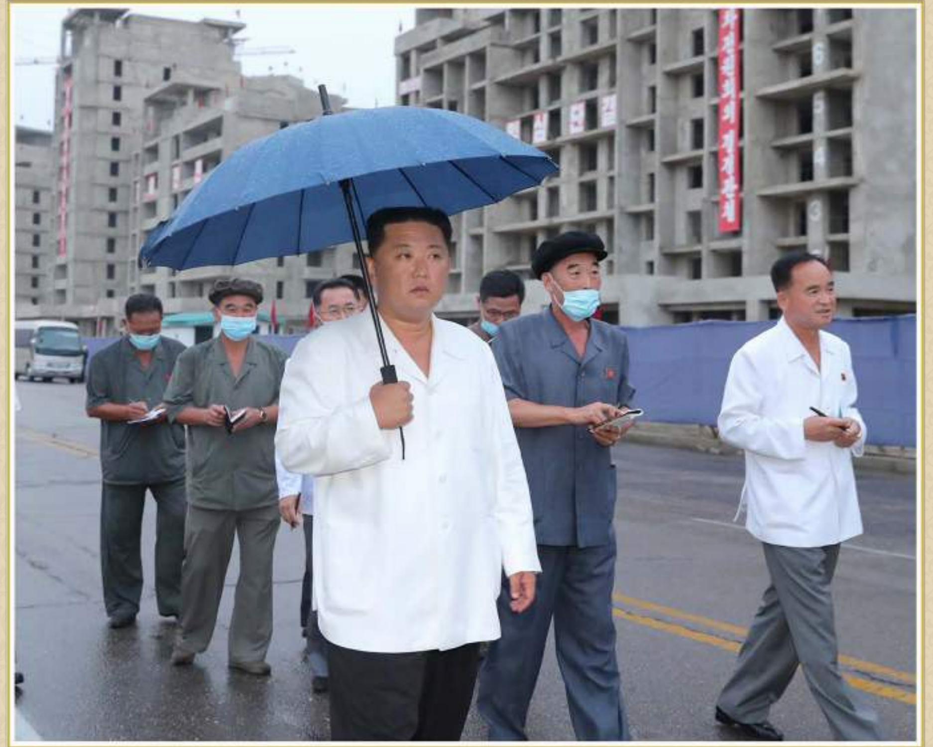
Kim Jong Un gives on-site guidance at the construction site of the Pothong Riverside Terraced Houses District in August Juche 110 (2021).