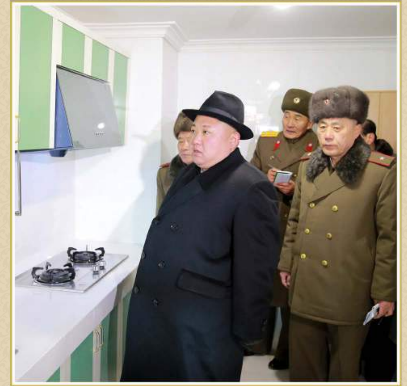
Kim Jong Un gives on-site guidance at the construction site of Ryomyong Street in January Juche 106 (2017).