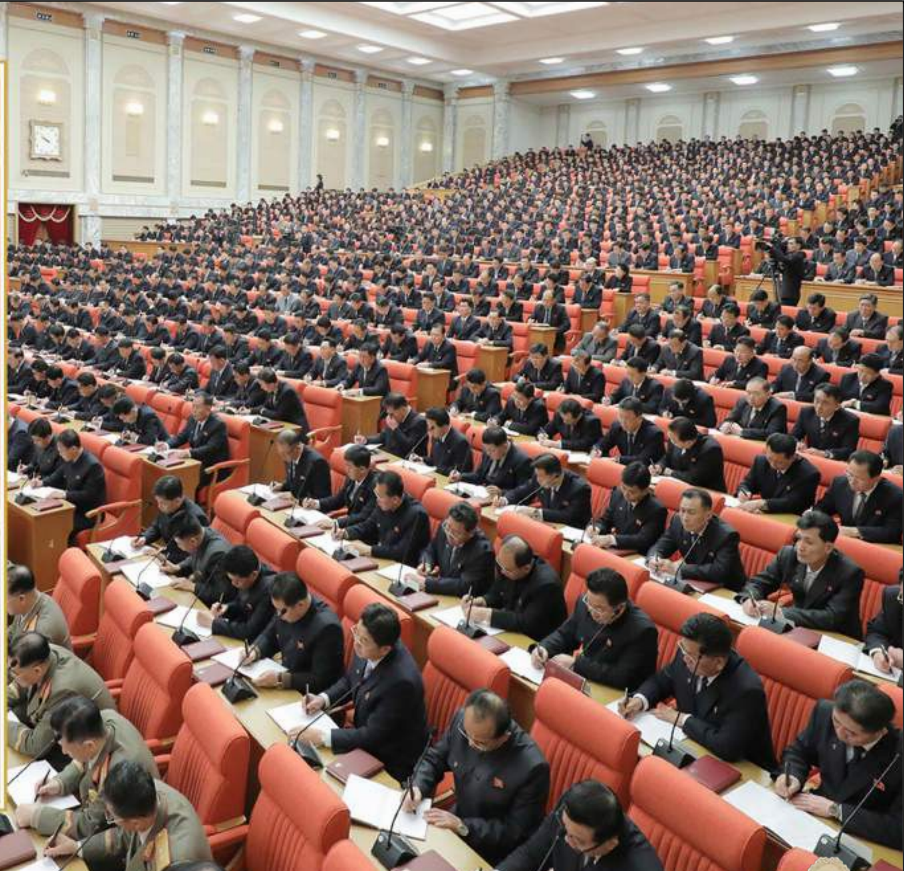
Kim Jong Un sets forth the task of renovating rural villages across the country as required by the new era of socialist rural development in December Juche 110 (2021).