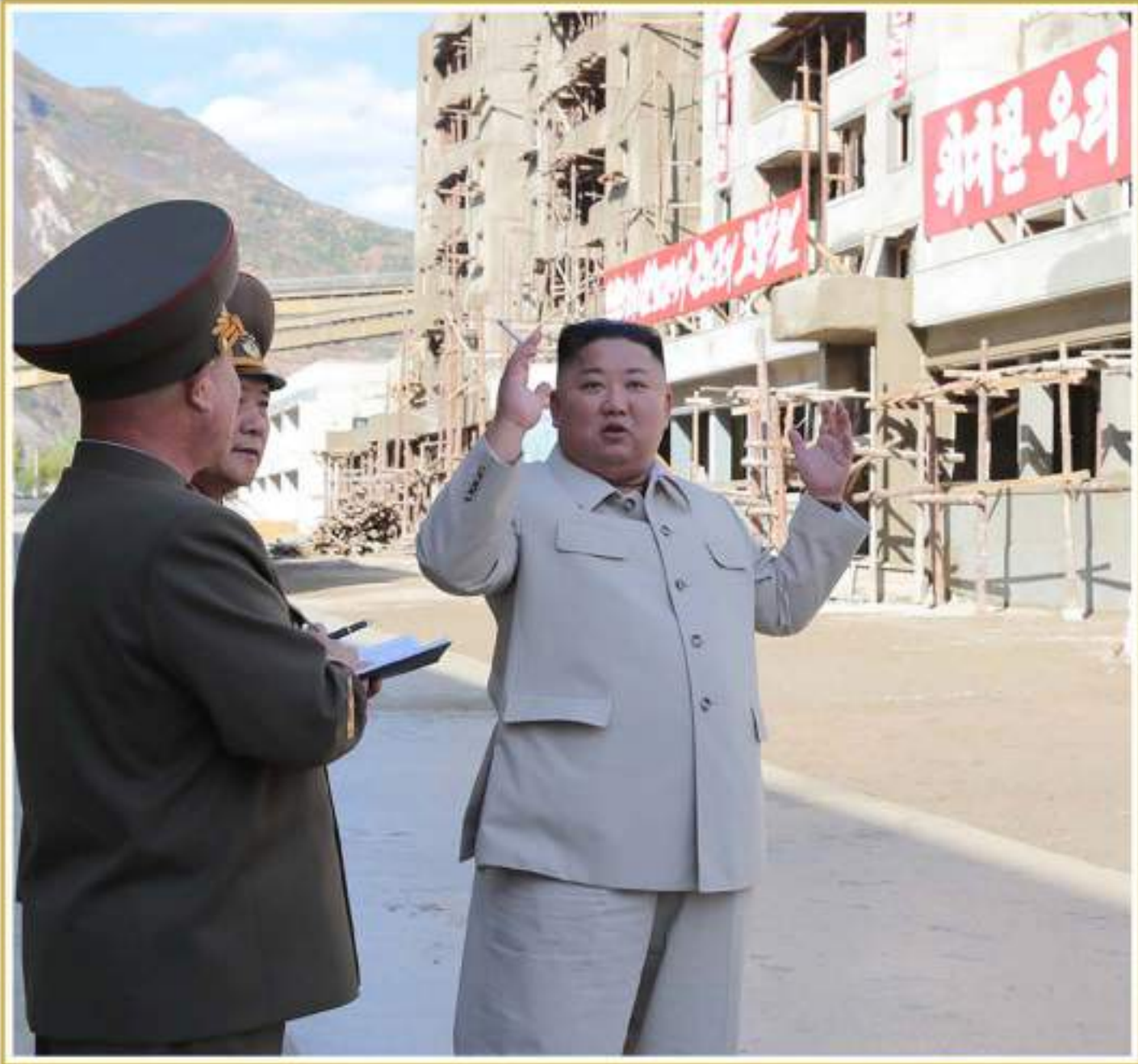
Kim Jong Un gives on-site guidance over construction in the flood-hit Komdok area, South Hamgyong Province, in October Juche 109 (2020).