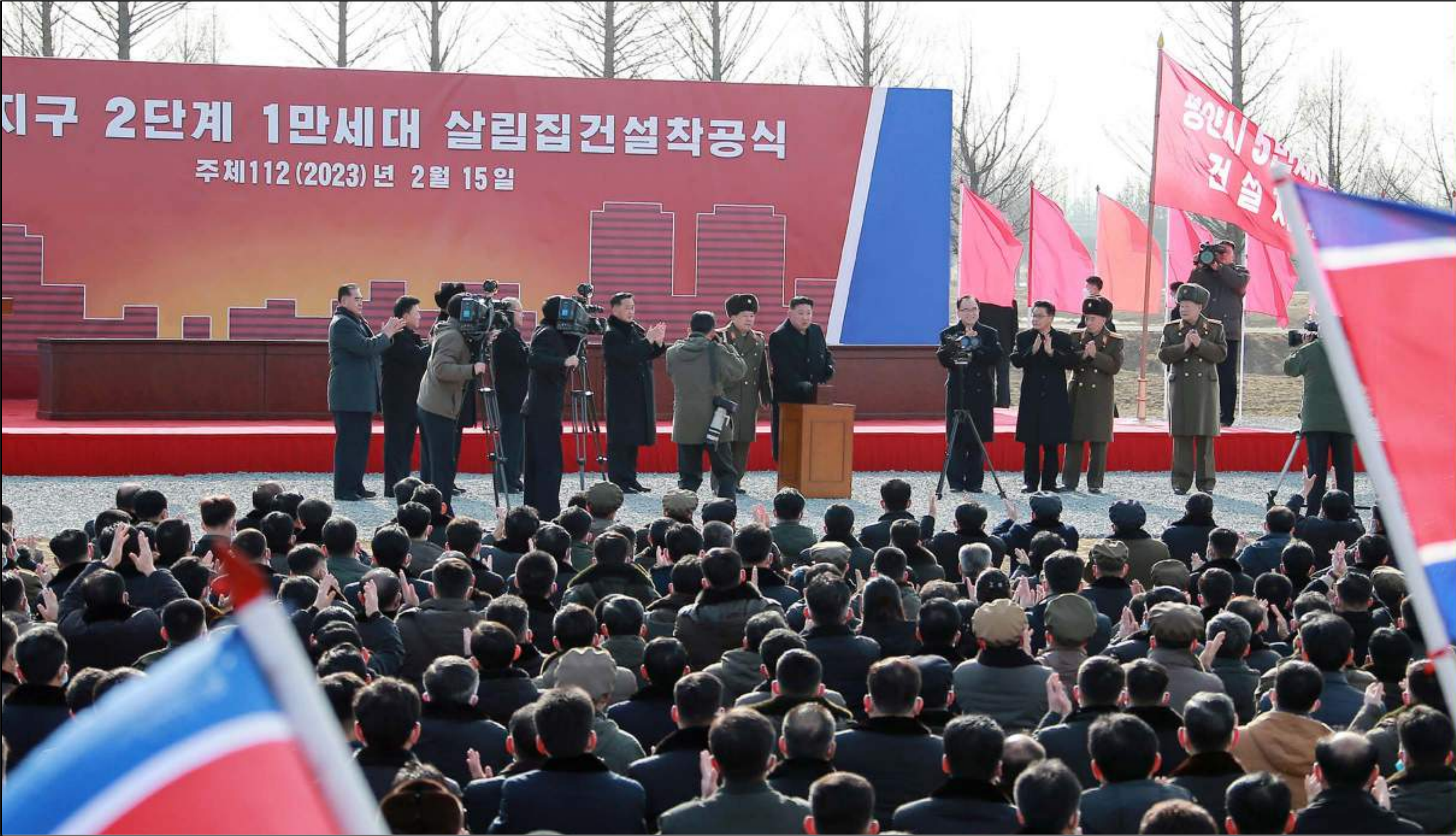
Kim Jong Un attends the ground-breaking ceremony for building 10 000 flats in the second-stage project in the Hwasong area in February Juche 112 (2023).