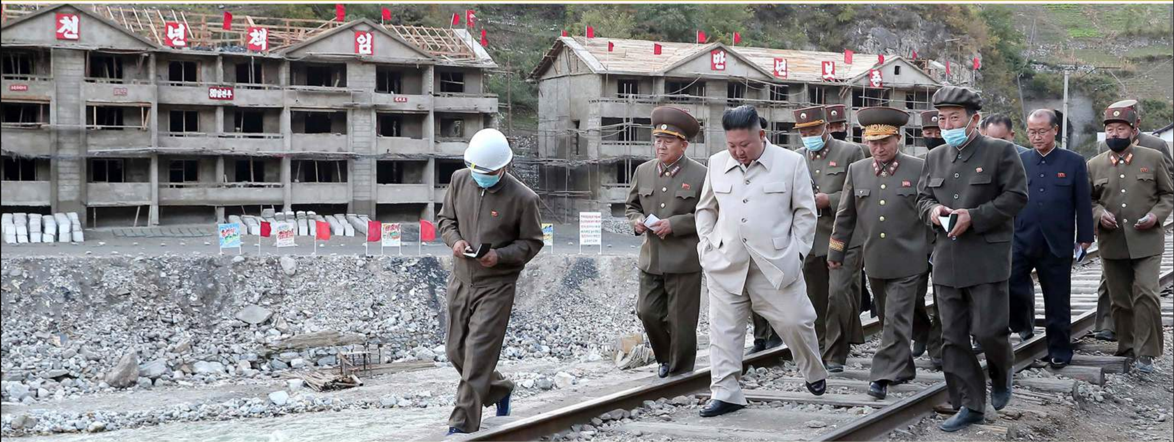
Kim Jong Un gives on-site guidance at the construction site of the flood-hit Komdok area, South Hamgyong Province, in October Juche 109 (2020).