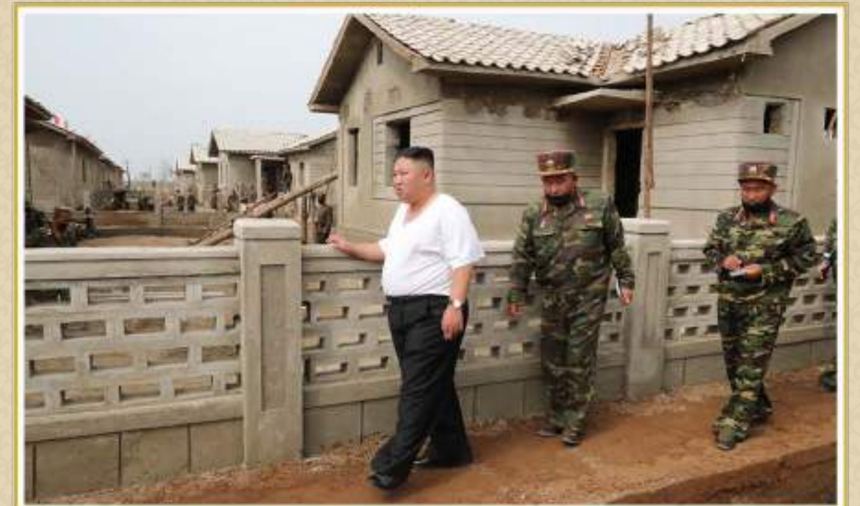
Kim Jong Un gives on-site guidance over construction in the flood-hit Taechong-ri area, Unpha County, North Hwanghae Province, in September Juche 109 (2020).