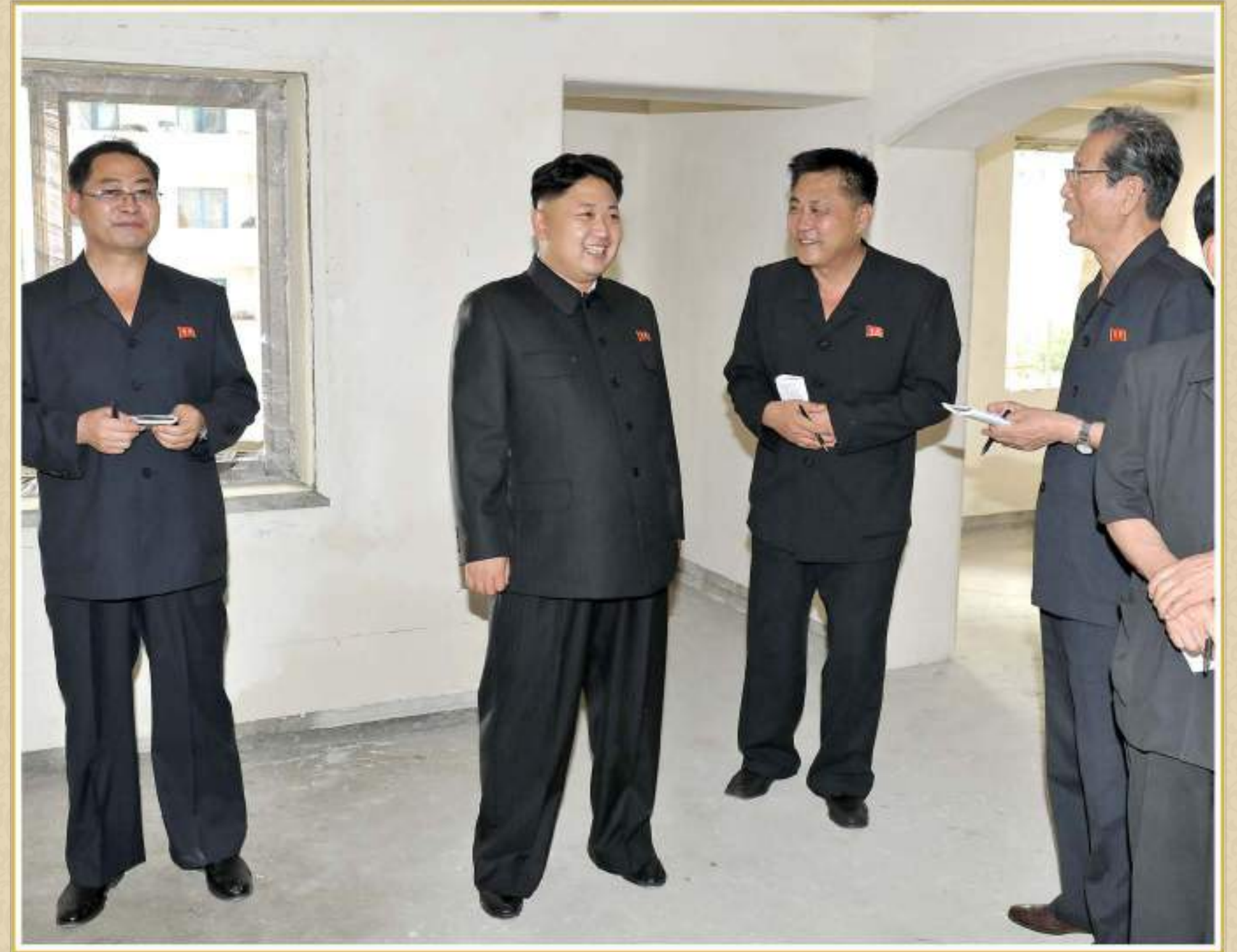
Kim Jong Un visits the construction site of apartment houses for scientists of Kim Il Sung University in August Juche 102 (2013).