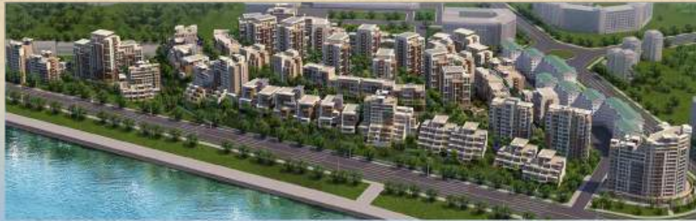
Kim Jong Un unfolds the plan of building a riverside terraced houses district near the Pothong Gate in March Juche 110 (2021).