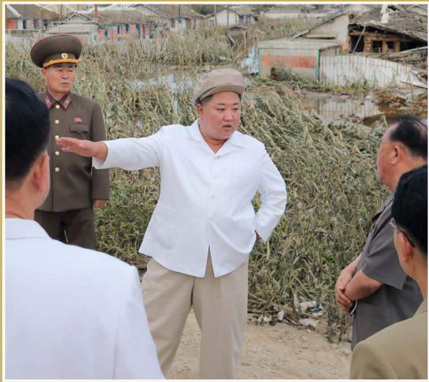
Kim Jong Un visits the typhoon-hit areas in South Hamgyong Province in September Juche 109 (2020).