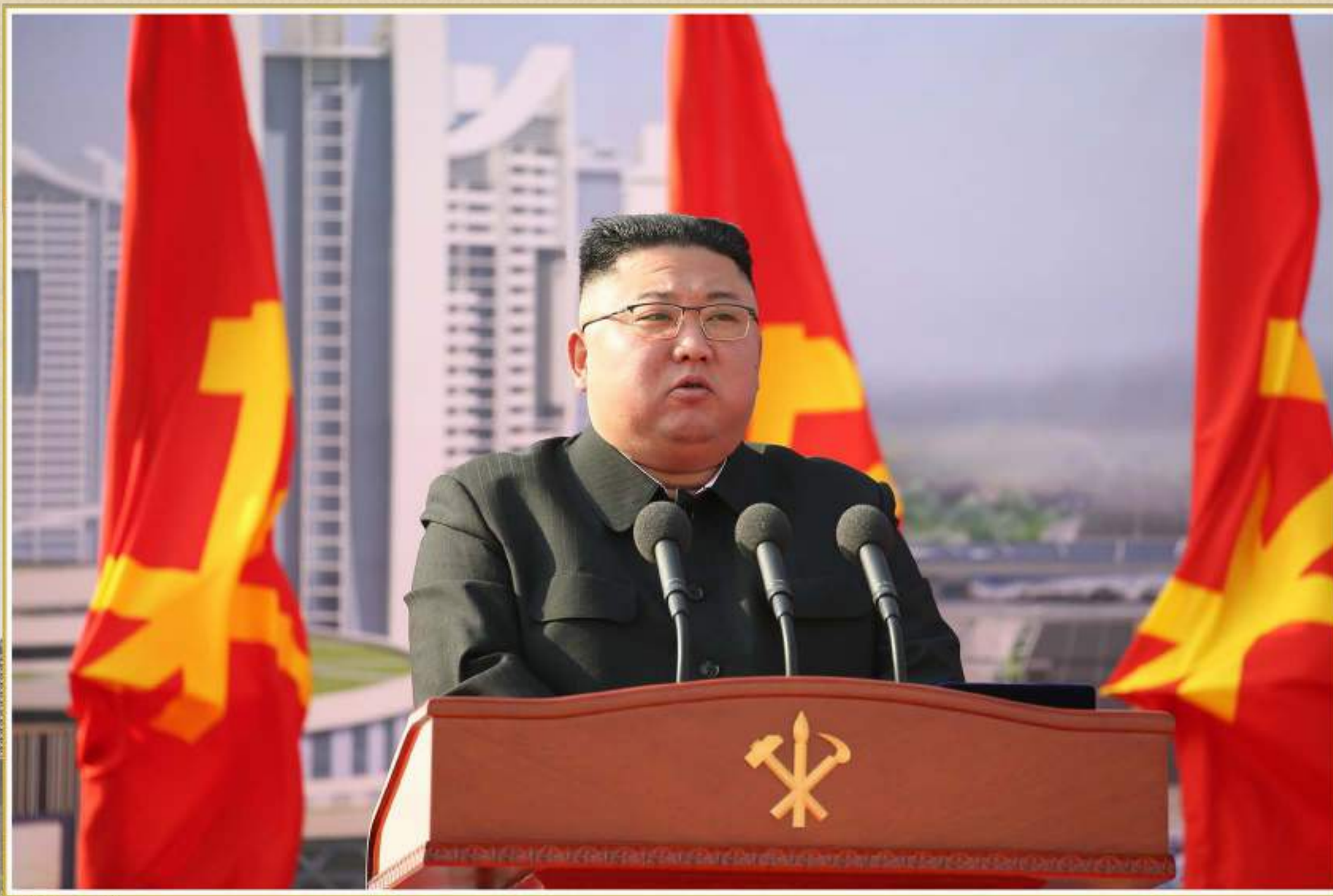
Kim Jong Un makes a speech at the ground-breaking ceremony for the construction of 10 000 flats in Pyongyang in March Juche 110 (2021).