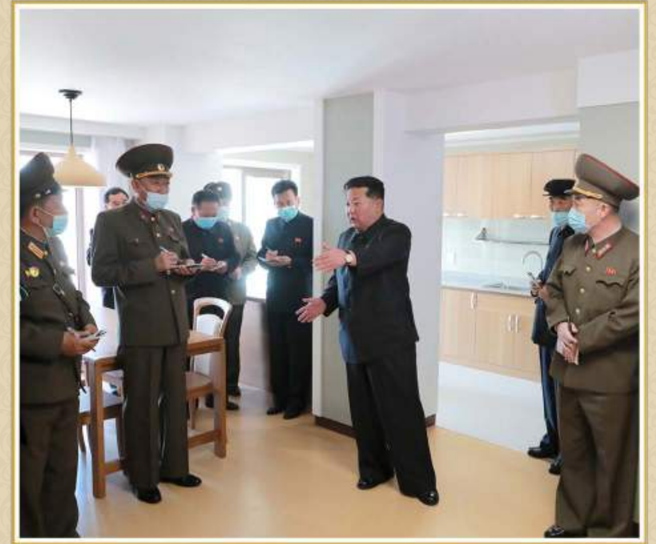
Kim Jong Un looks round the Pothong Riverside Terraced Houses District in Kyongru-dong in April Juche 111 (2022).