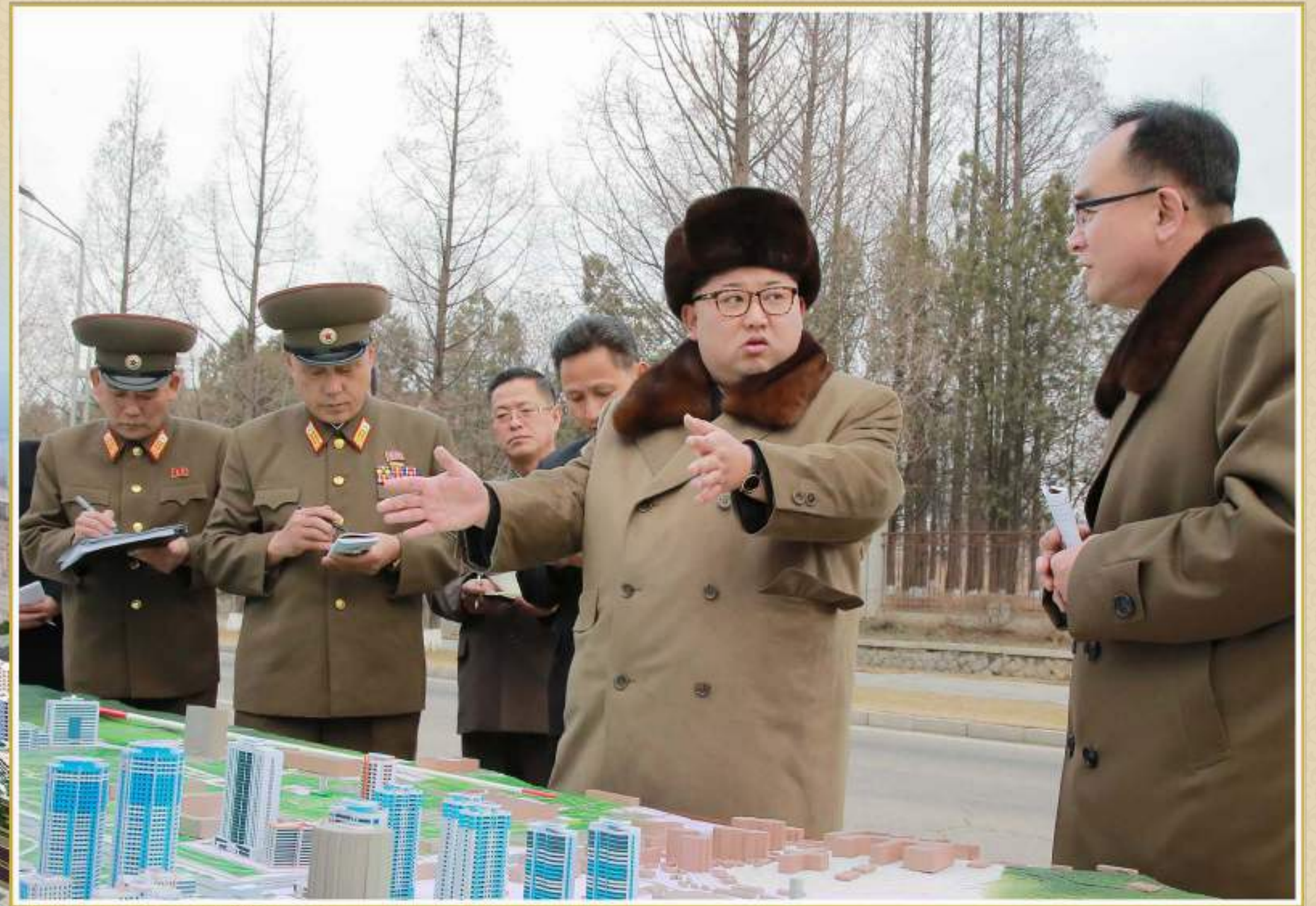
Kim Jong Un gives important tasks for the project after declaring to the public the construction of Ryomyong Street in March Juche 105 (2016).