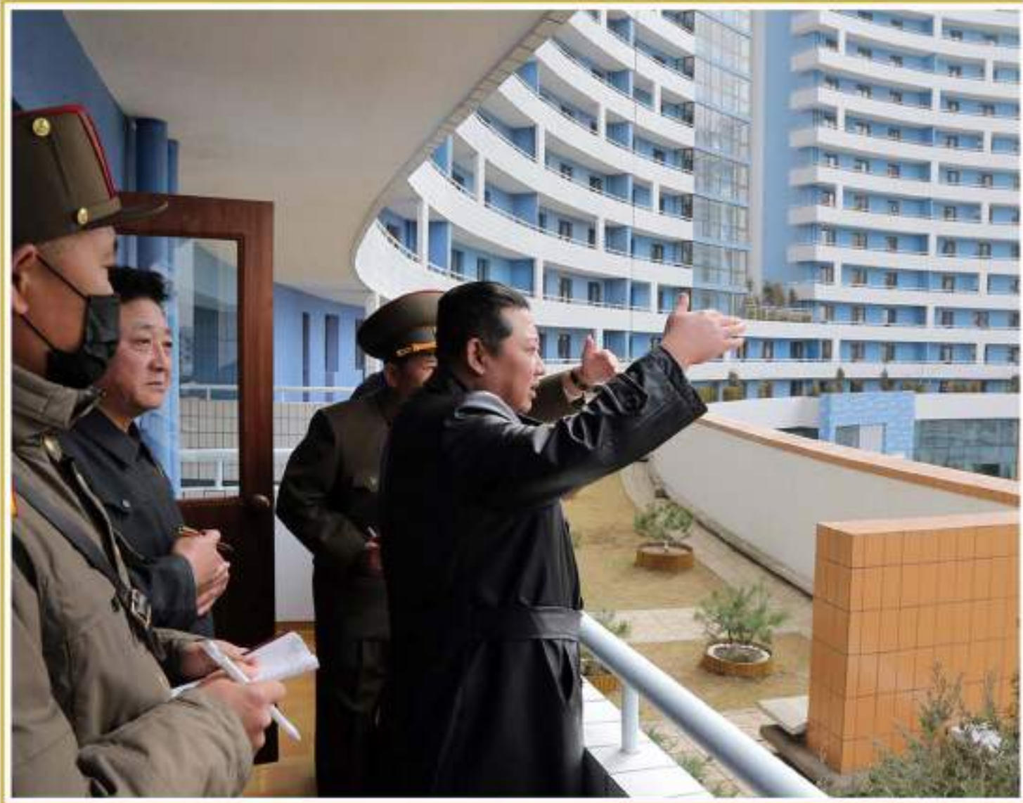
Kim Jong Un gives on-site guidance at the construction site of 10 000 flats in the Songsin and Songhwa areas nearing completion in March Juche 111 (2022).