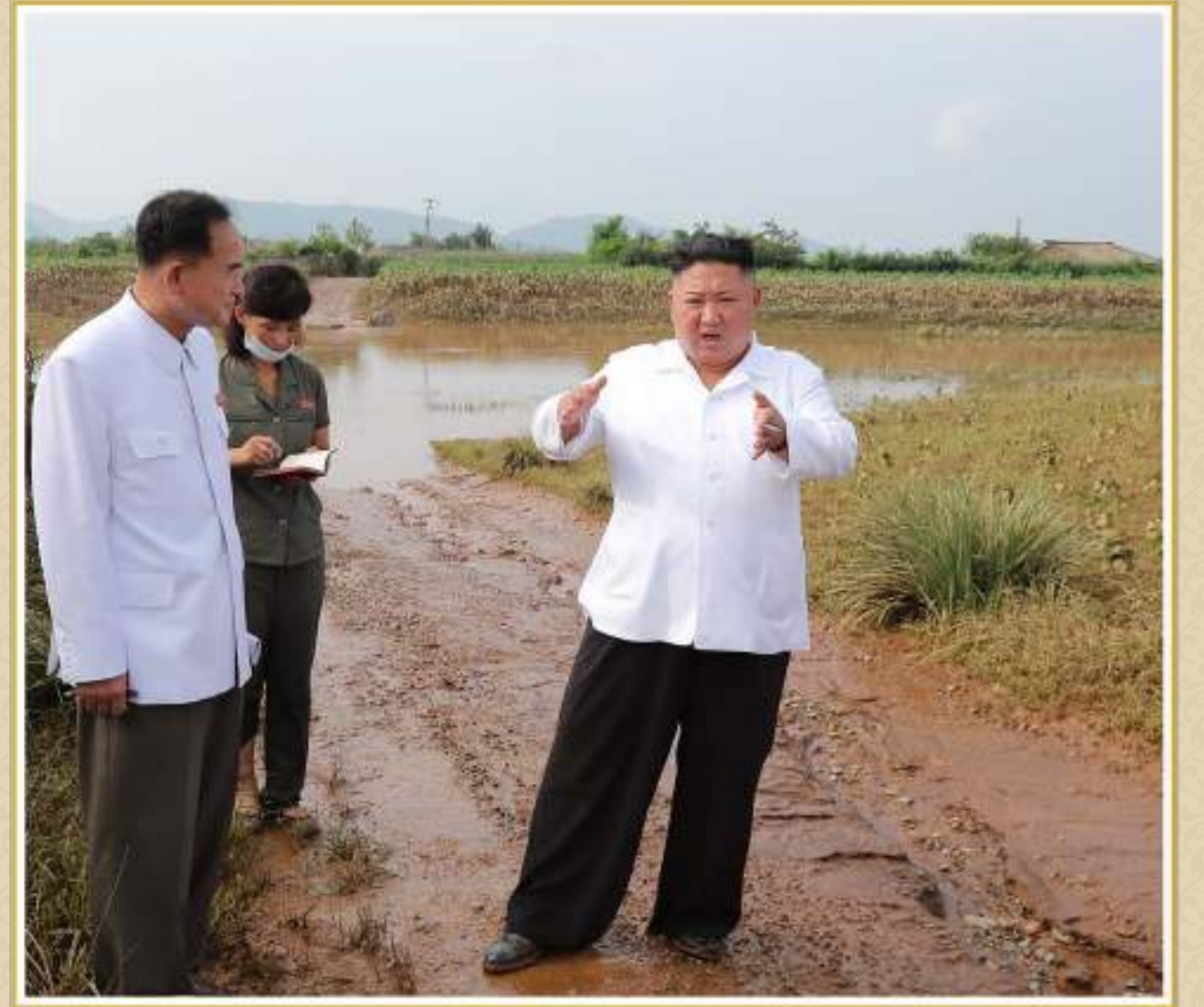
Kim Jong Un visits the flood-hit Taechong-ri area, Unpha County, North Hwanghae Province, in August Juche 109 (2020).