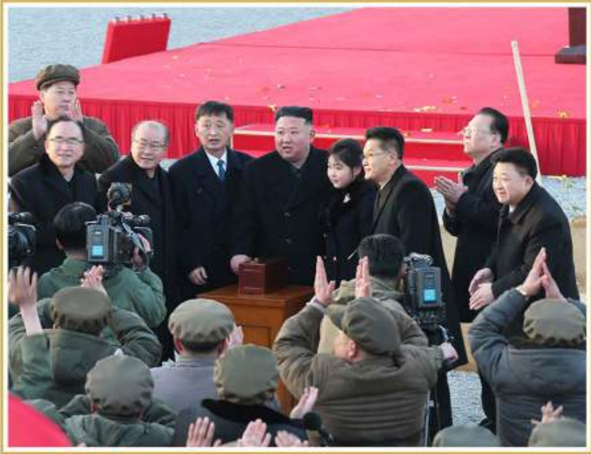
Kim Jong Un attends the ground-breaking ceremony for a project to build a new street in the Sopho area in Pyongyang in February Juche 112 (2023).