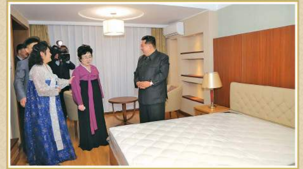
Kim Jong Un, at the inauguration ceremony of the Pothong Riverside Terraced Houses District in April Juche 111 (2022), meets and congratulates merited persons who are to move to the new houses.