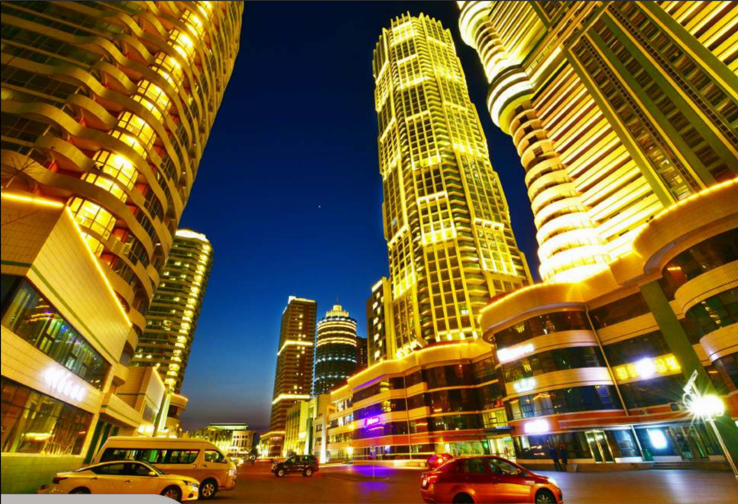
Cradle of Happiness for the People