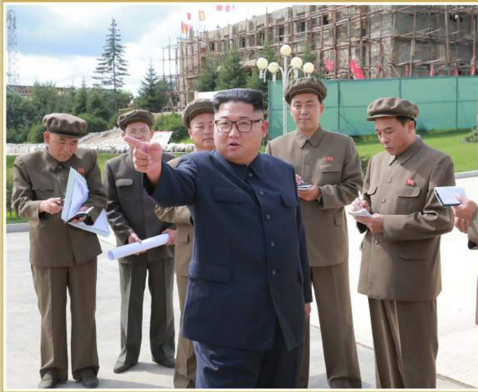
Kim Jong Un gives on-site guidance at construction sites in Samjiyon County again in August Juche 107 (2018).