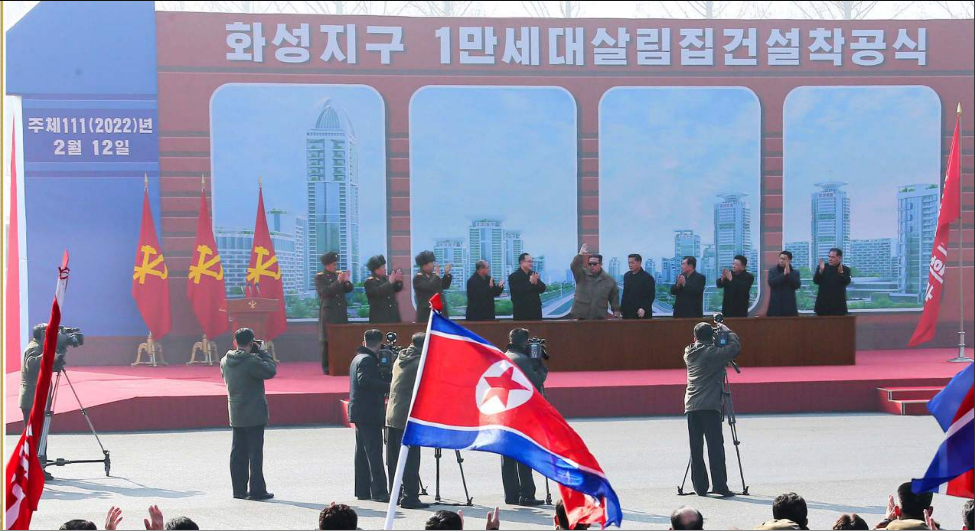
Kim Jong Un attends the ground-breaking ceremony for a project to build 10 000 flats in the Hwasong area in February Juche 111 (2022).