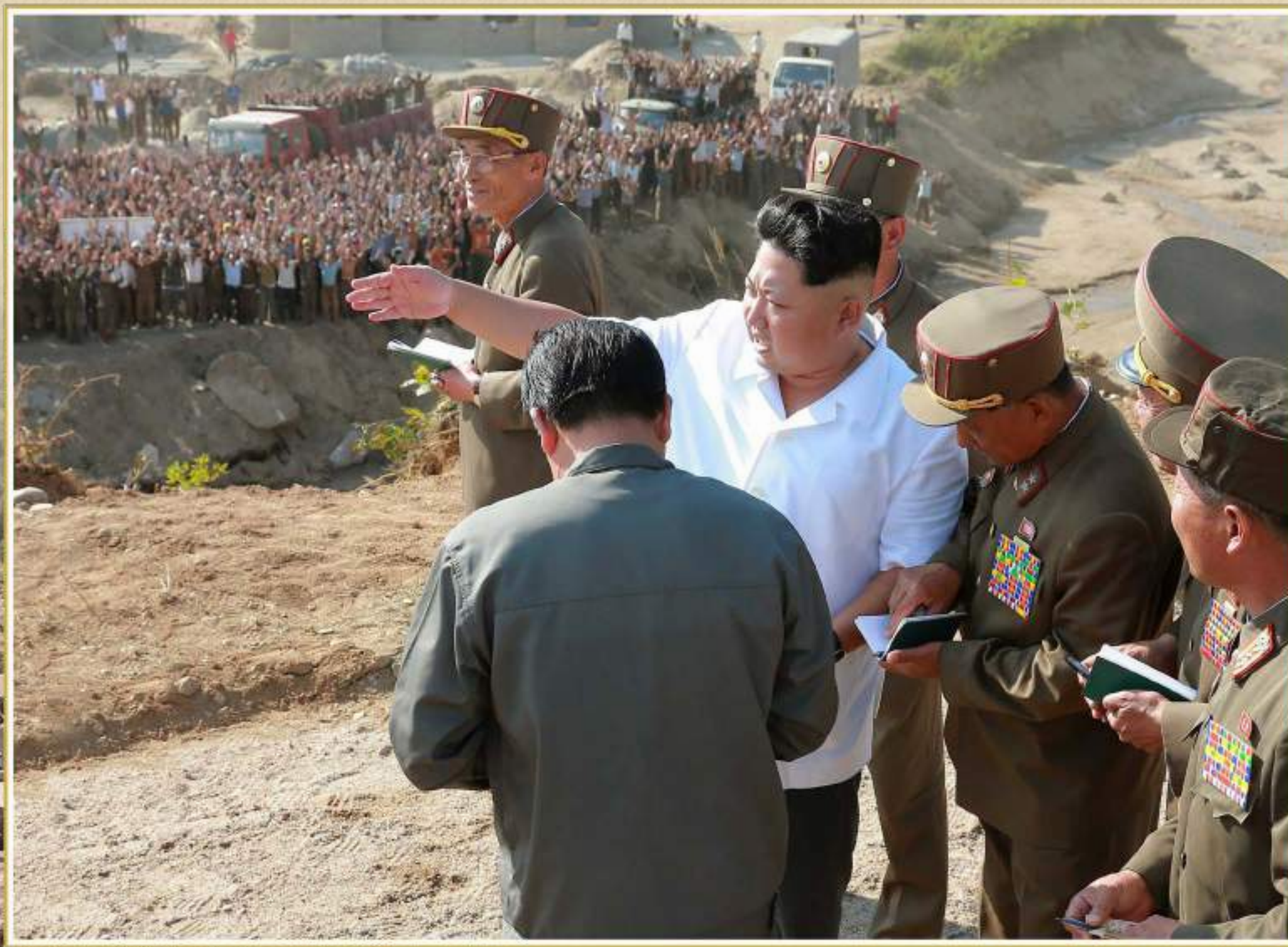
Kim Jong Un gives on-site guidance for rehabilitation of the flood-hit city of Rason in September Juche 104 (2015).