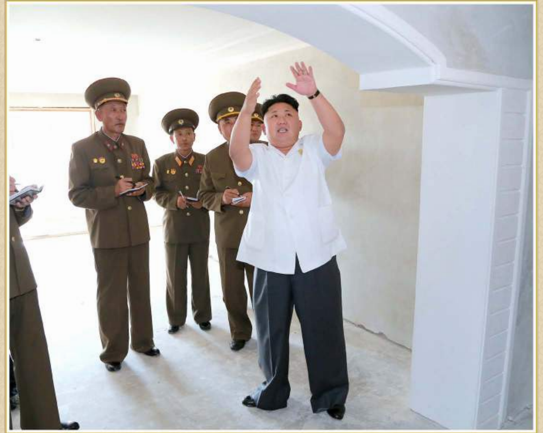
Kim Jong Un gives on-site guidance at the construction site of apartment houses for teachers of Kim Chaek University of Technology nearing completion in August Juche 103 (2014).