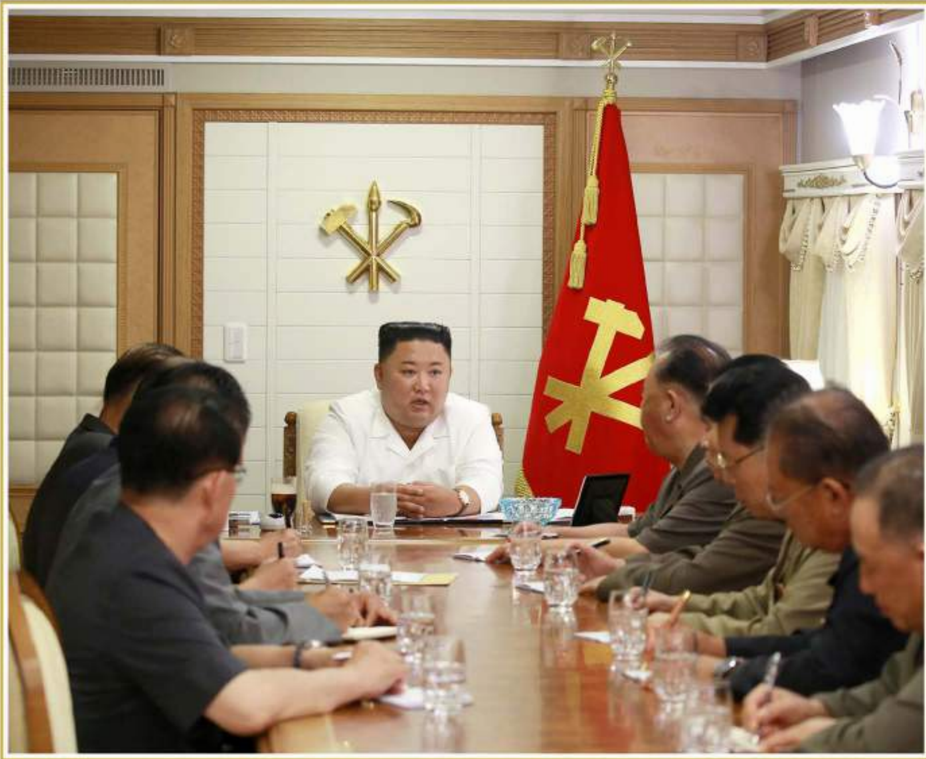
Kim Jong Un guides an enlarged meeting of the Executive Policy Council of the Central Committee of the WPK held in an affected area for the organization of the rehabilitation projects in the areas in North and South Hamgyong provinces hit by typhoon No. 9 in September Juche 109 (2020).