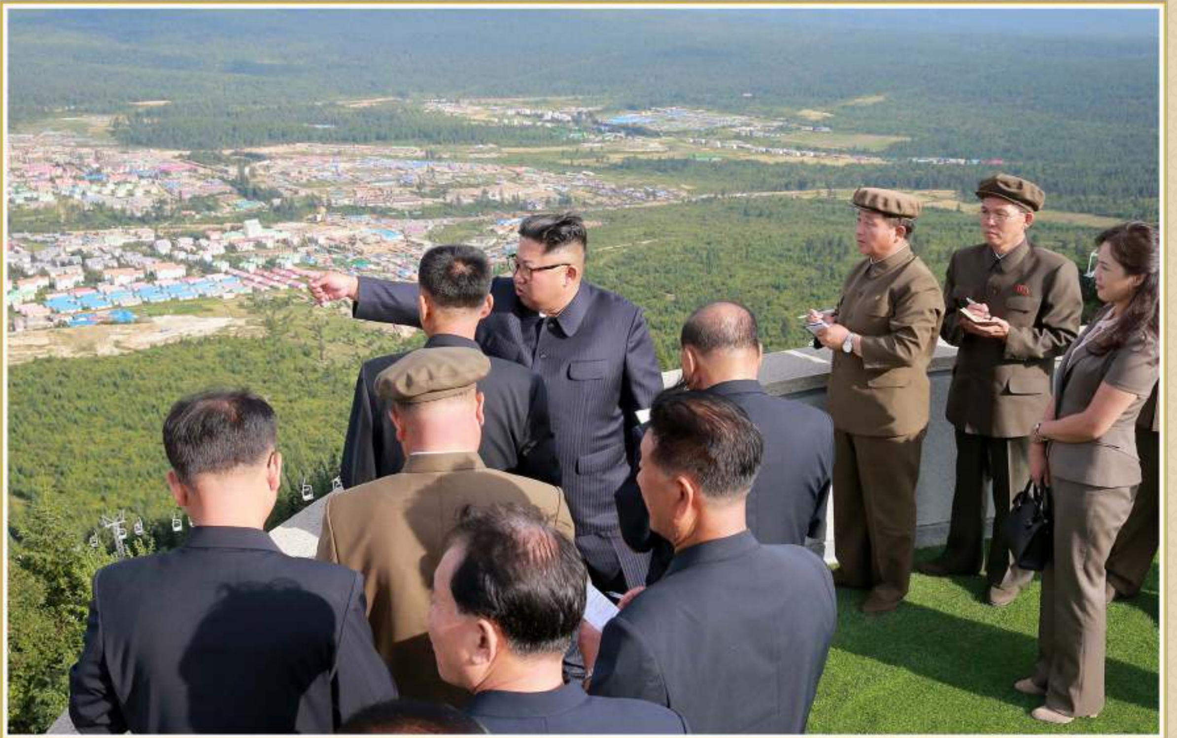
Kim Jong Un gives on-site guidance at construction sites in Samjiyon County in August Juche 107 (2018).