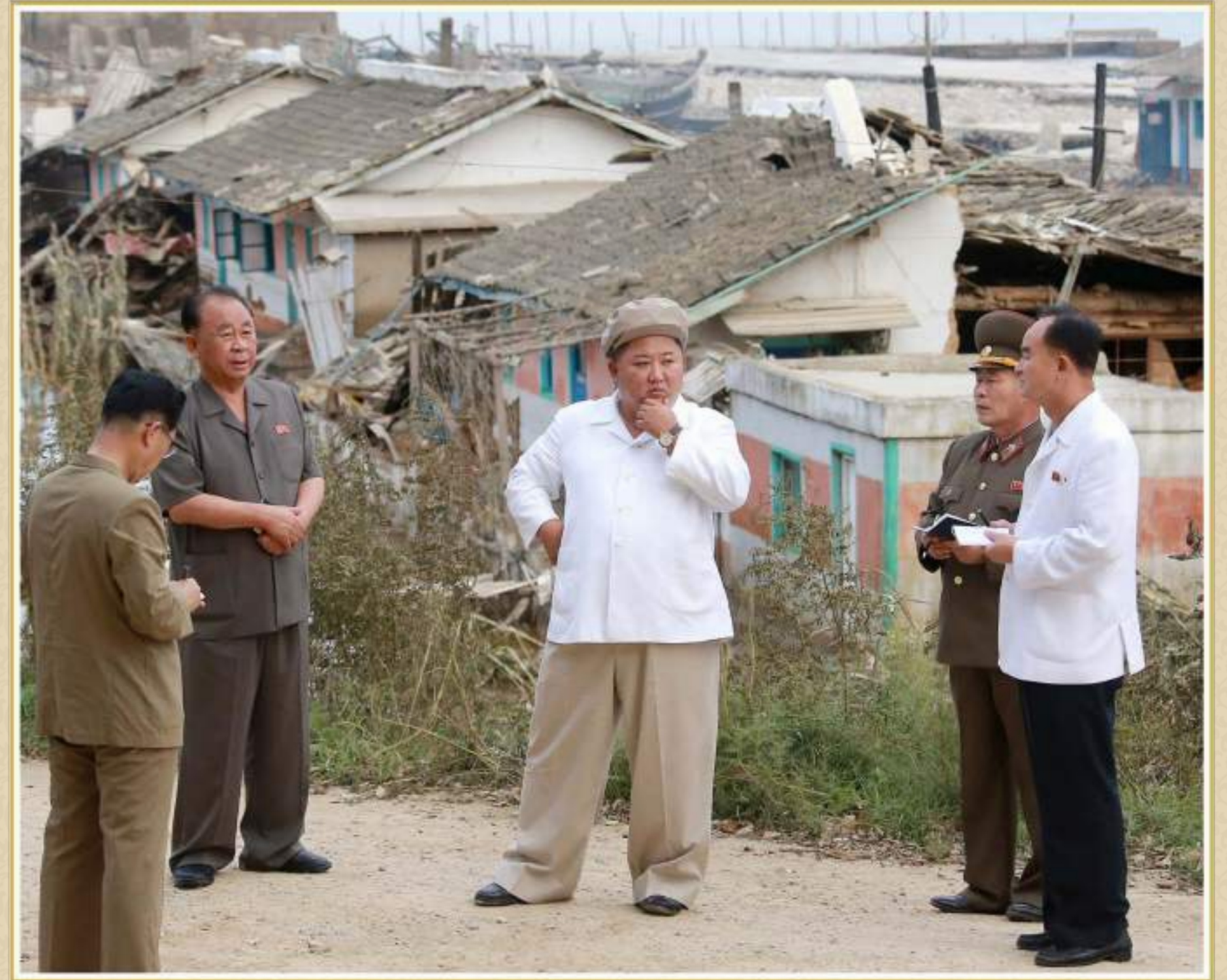
Kim Jong Un visits the typhoon-hit areas in South Hamgyong Province in September Juche 109 (2020).