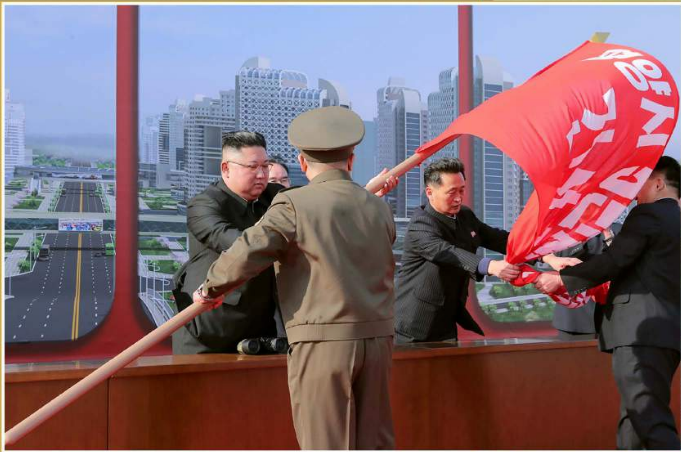
Kim Jong Un hands over the flag of the construction headquarters of 50 000 flats in Pyongyang at the ground-breaking ceremony for a project to build 10 000 flats in March Juche 110 (2021).