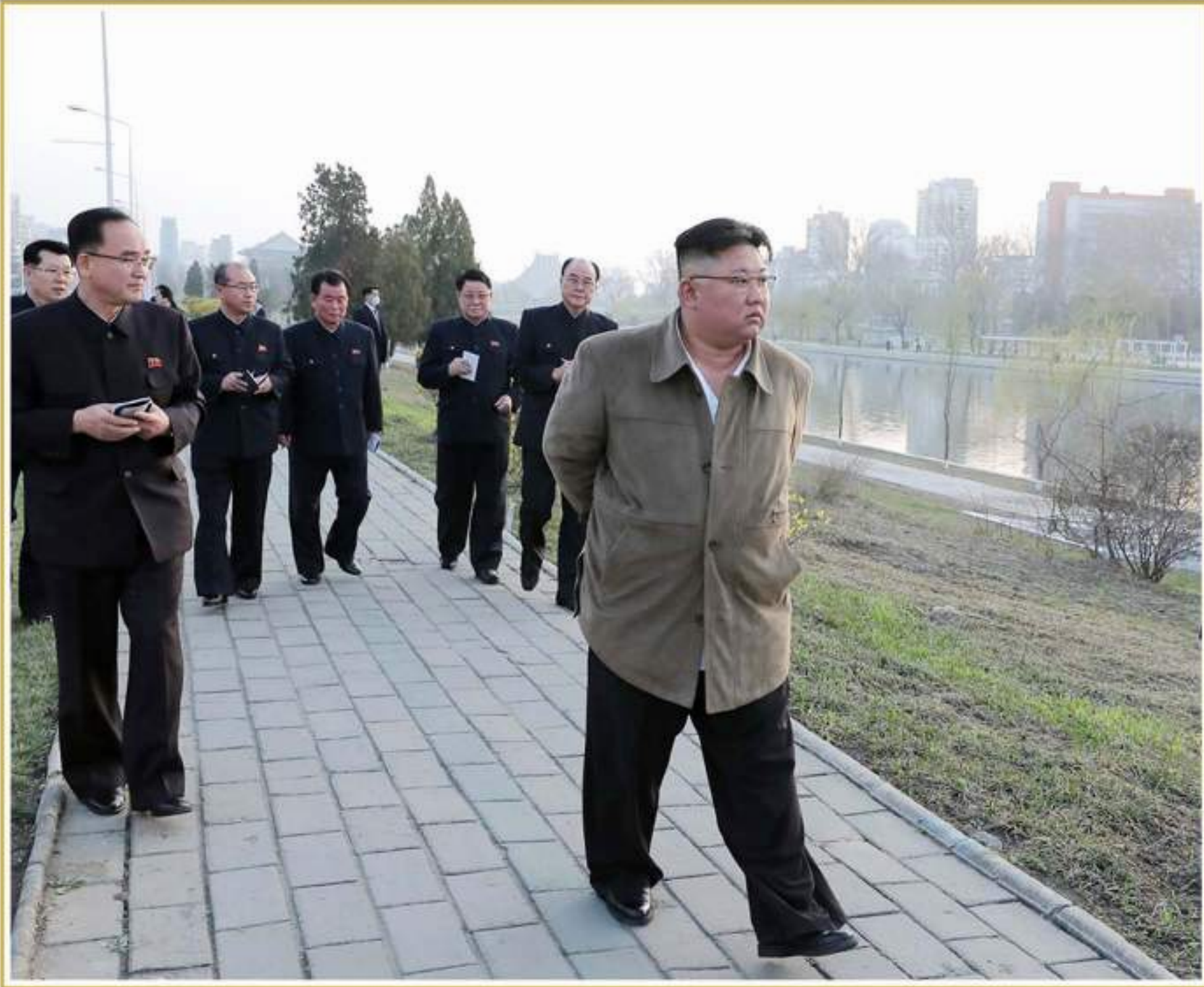
Kim Jong Un visits the site for the Pothong Riverside Terraced Houses District again in March Juche 110 (2021).