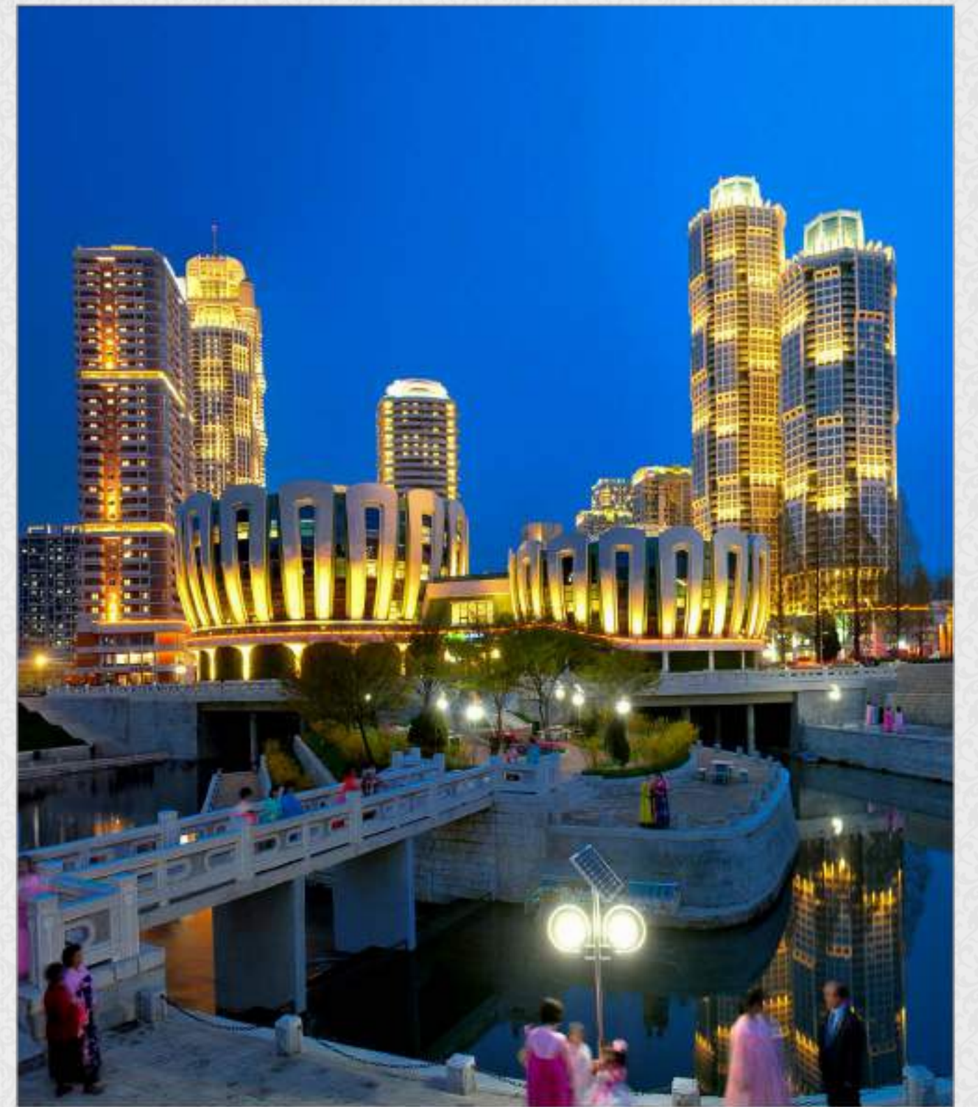
New Streets and Houses Embodying the People's Ideals