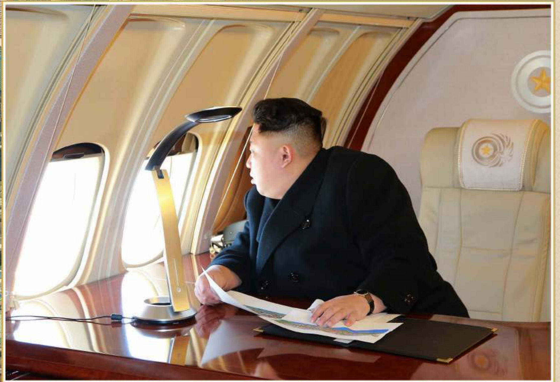
Kim Jong Un looks down over the construction site of Mirae Scientists Street in February Juche 104 (2015).