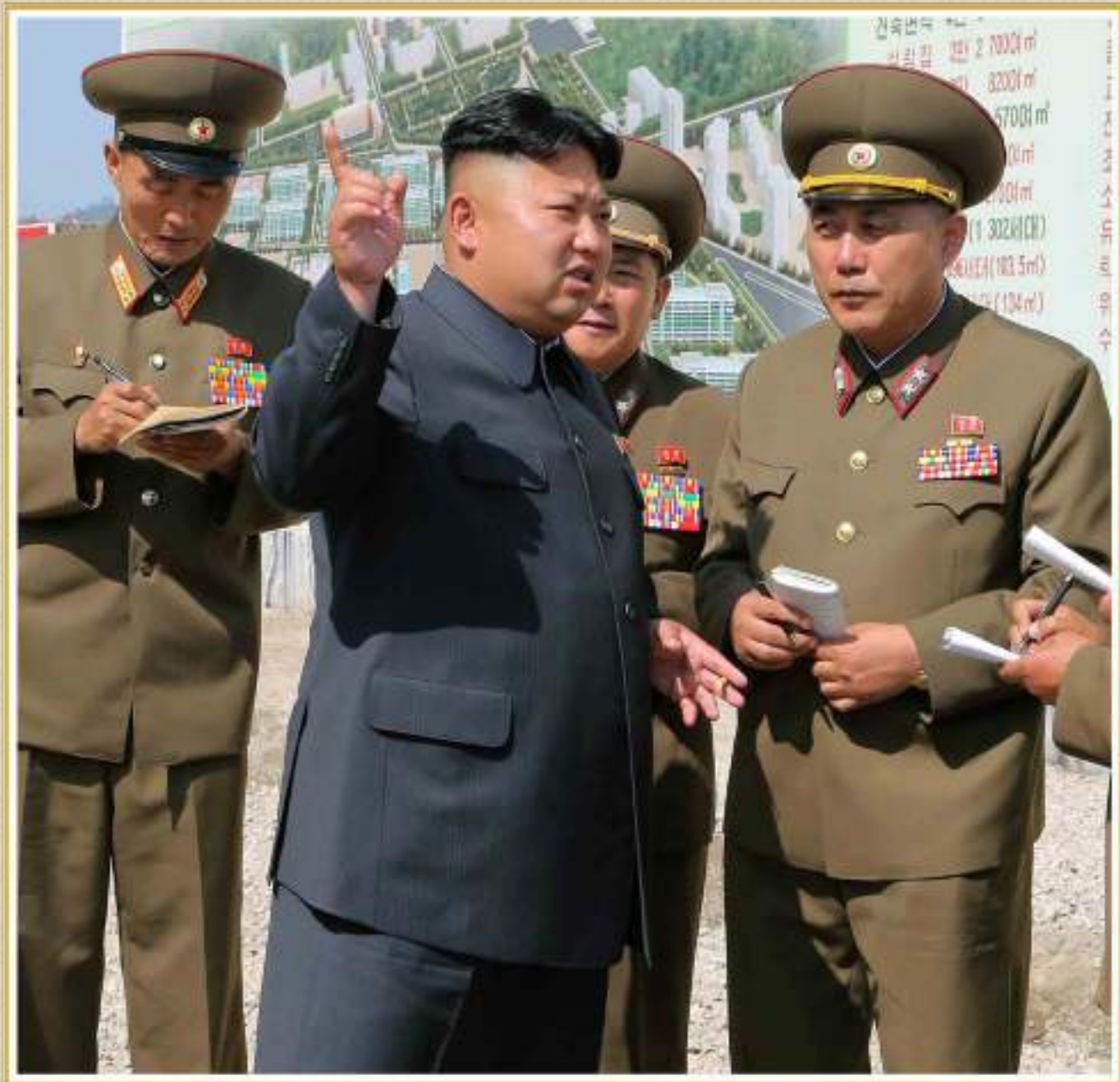
Kim Jong Un gives on-site guidance at the construction site of Wisong Scientists Street in June Juche 103 (2014).