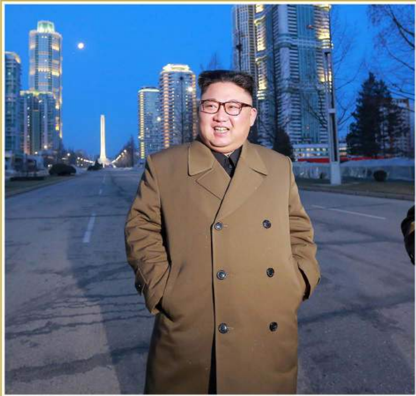
Kim Jong Un gives on-site guidance at the construction site of Ryomyong Street again in March Juche 106 (2017).