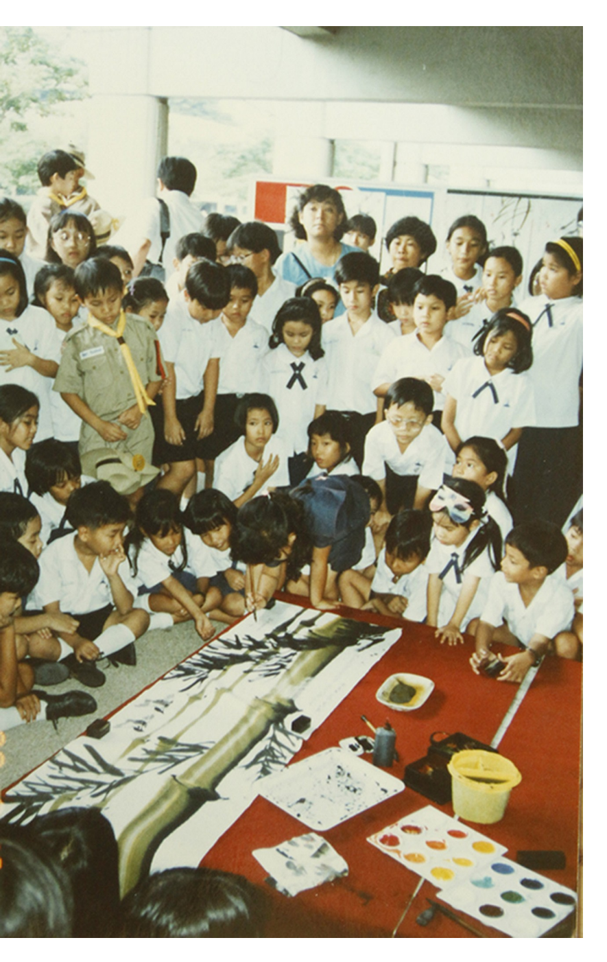
O's art show held in Thailand in 1989