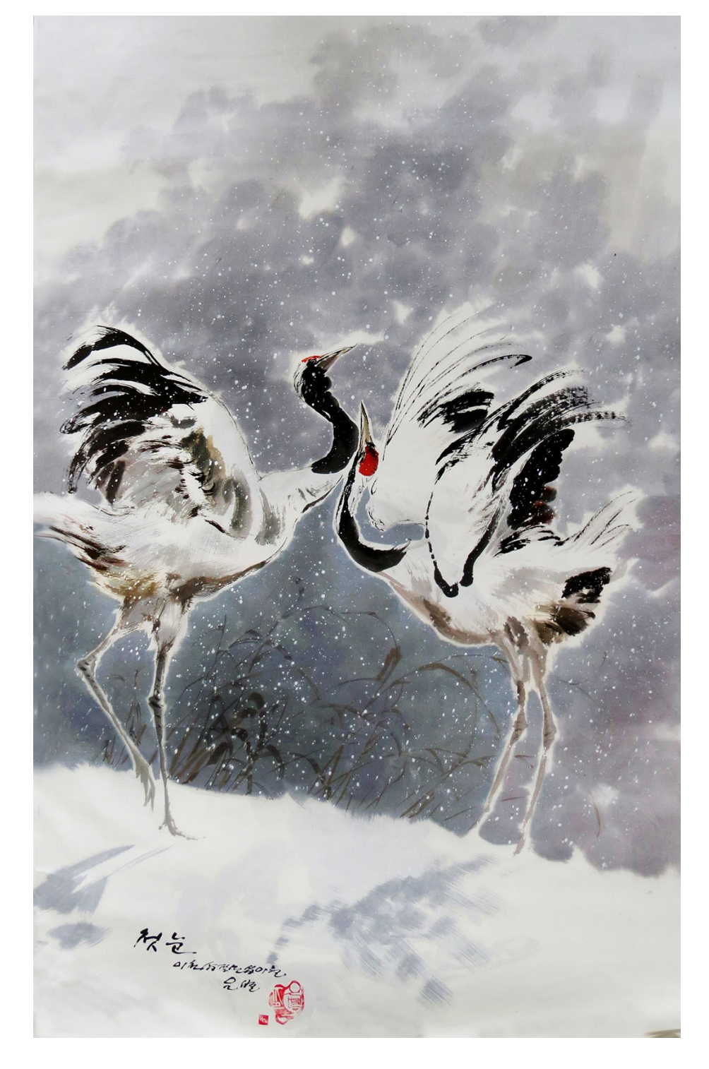
Korean painting "The first snow" (800×1 600 mm)